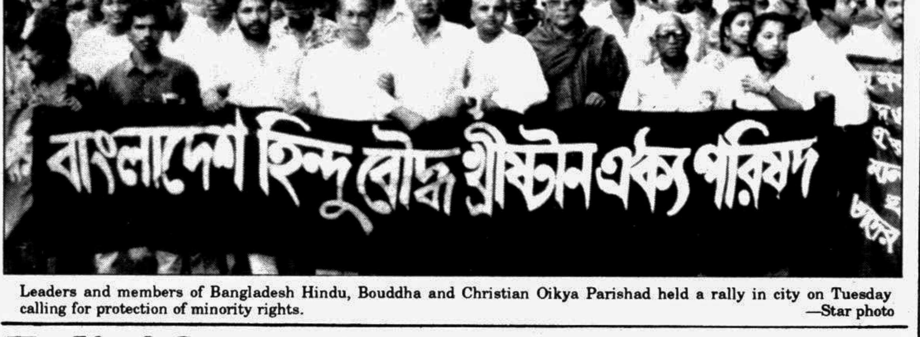
Leaders and members of Bangladesh Hindu, Bouddha and Christian Oikya Parishad held a rally in city on Tuesday calling for protection of minority rights.