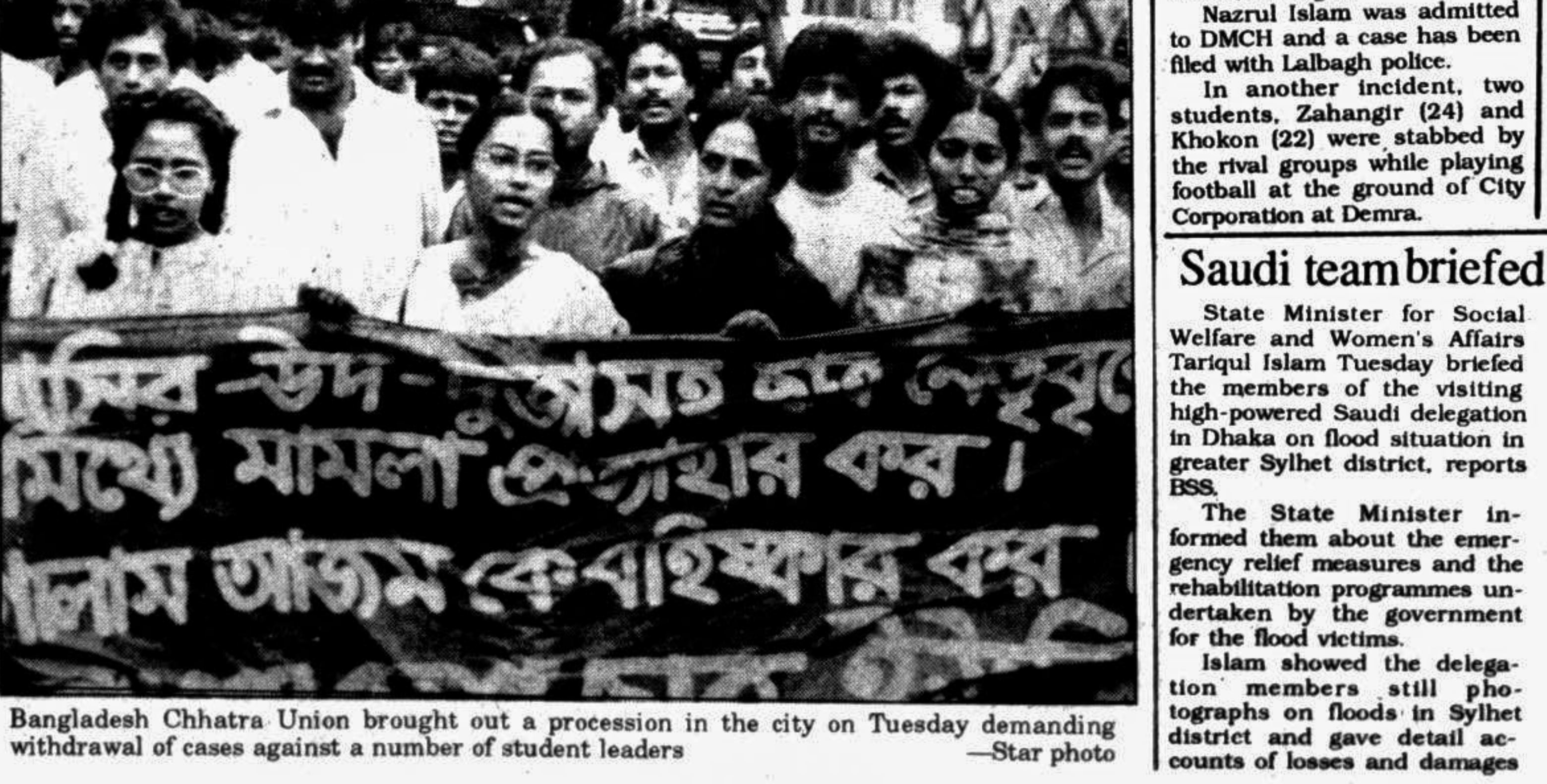
Bangladesh Chhatra Union brought out a procession in the city on Tuesday demanding withdrawal of cases against a number of student leaders.