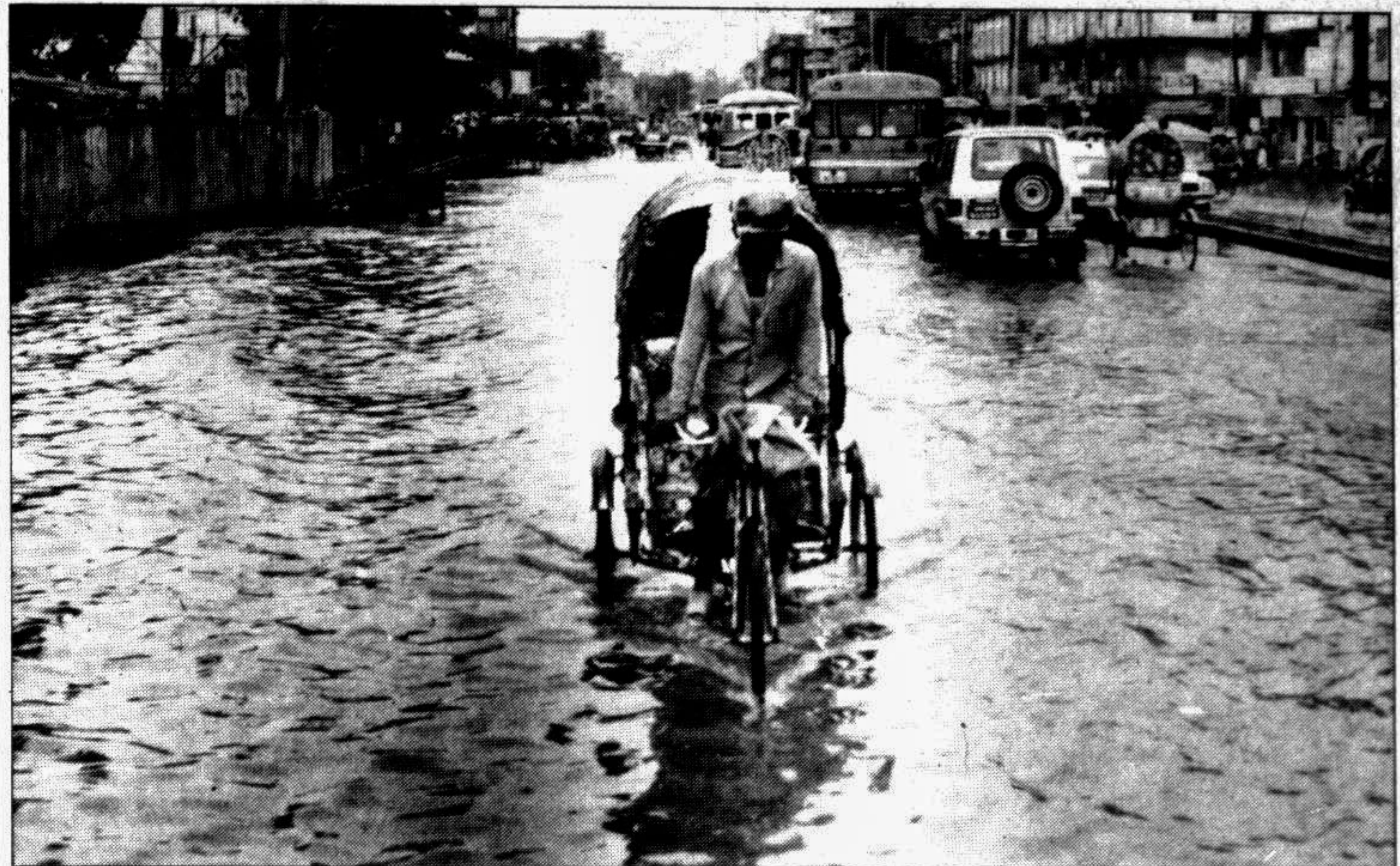
CITY TURNED SWAMP: A street in the capital Dhaka after heavy rains yesterday.

Prime Minister Begum Khaleda Zia assured them of diplomatic passports saying See Page 10 Col. 6