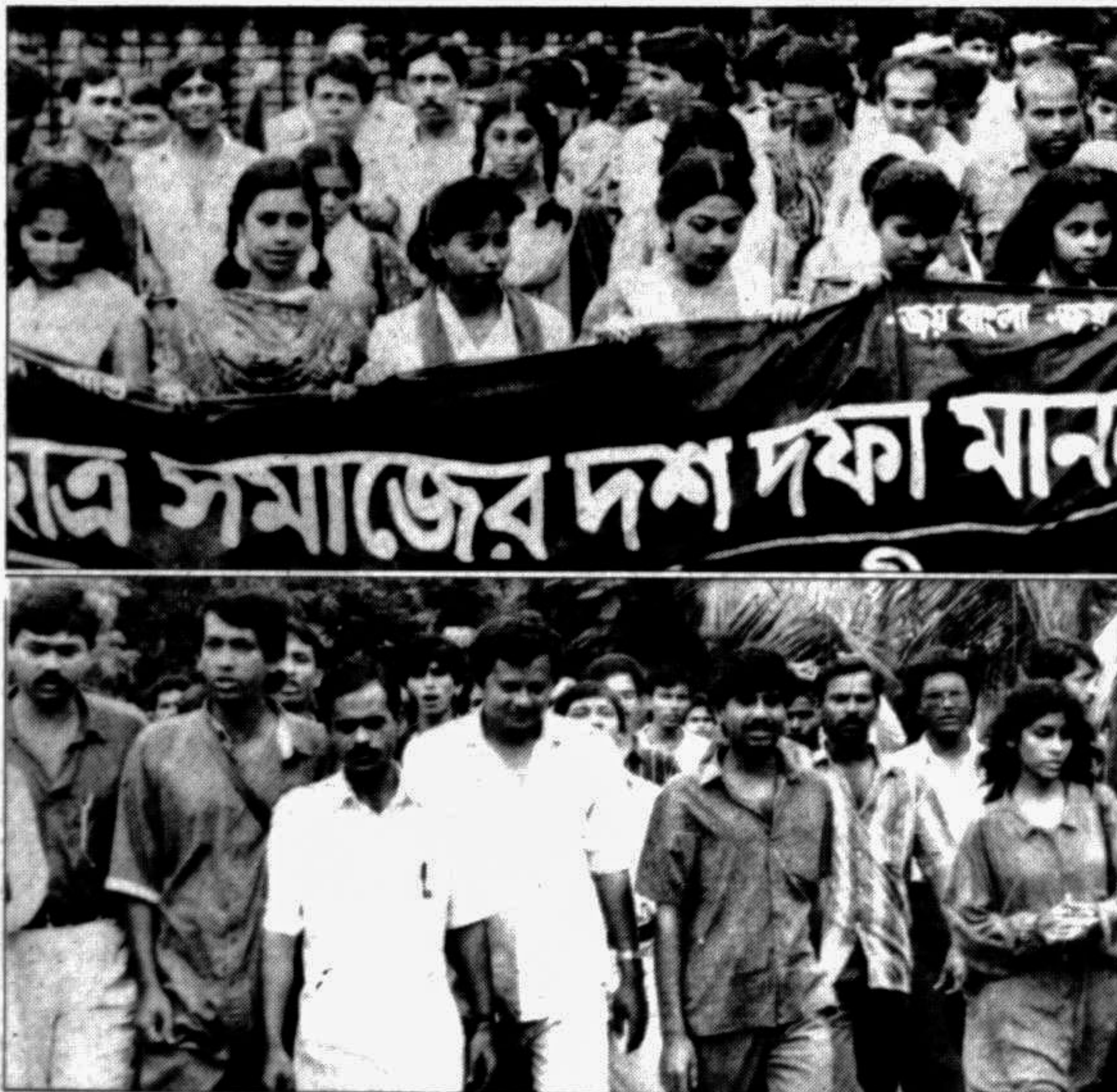
Processions by Awami League-backed Chhatra League (above) and pro-JSD (Inu) Chhatra League on the DU campus that preceded submission of memorandum to the Speaker on Tuesday.

TIRANA, June 11: Albania's political parties have agreed on the country's first non-Communist government in over 40 years, official sources said today, reports Reuters.