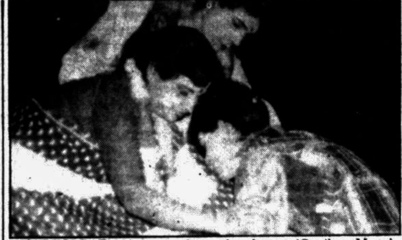
NABINAGAR: A scene from the drama 'Gariber Meye' staged at Uttar Fatehpur under the auspices of Juba Sangha recently.

At least 32 people were injured, seven of them seriously, in two separate accidents on Dhaka-Aricha Highway on Sunday. At least 22 people were injured when a truck and a minibuss collided on Dhaleswar bridge at Jagir of Manikganj district in the afternoon. Firefighters from Manikganj with the help of local people rescued the injured persons. According to district administration sources, 18 of the injured were rushed to Sadar Hospital and 15 of the them were later shifted to hospitals in Dhaka. Our DMCH correspondent adds: Five of the injured persons were admitted to the Dhaka Medical College Hospital. Of them, the condition of three, including the truck