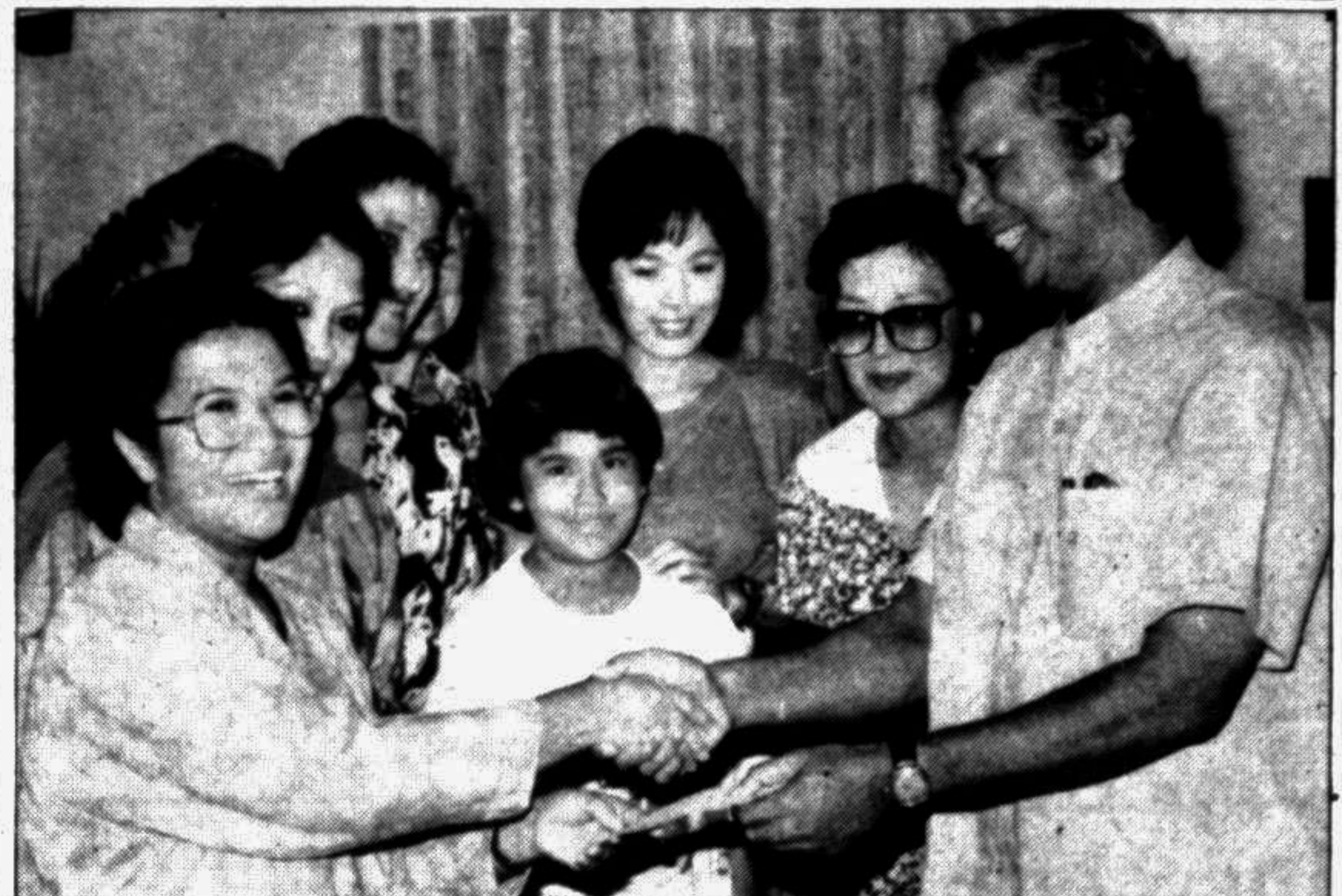
The Malaysian High Commissioner in Bangladesh seen handing over a cheque to the Grameen Bank Managing Director for income generating project for cyclone victims

BANSKHALI (Chittagong) June 10: The government has taken up a long-term programme for rehabilitation of 40,000 cyclone and tidal surge affected families of Banskhal upazila, reports BSS. The programme is being executed in phases. Taka ten lakh and 3700 bundles of CI sheets have been allocated for the first phase.