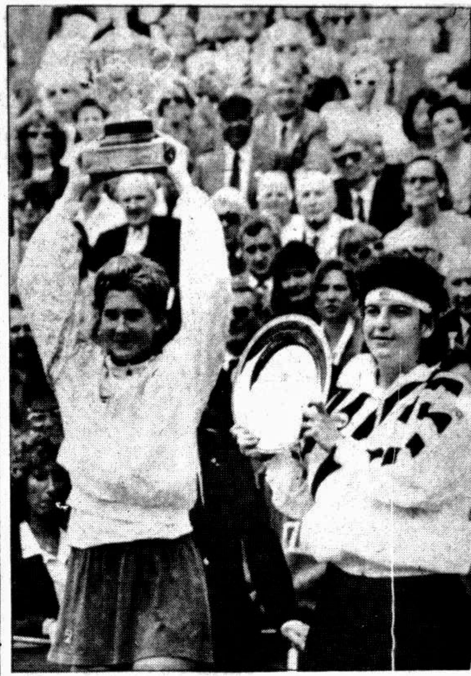
Monica Seles (L) presents her trophy to public in Paris on June 8 after her victory against Arantxa Sanchez (R) in French Open final. Seles won 6-3, 6-4.