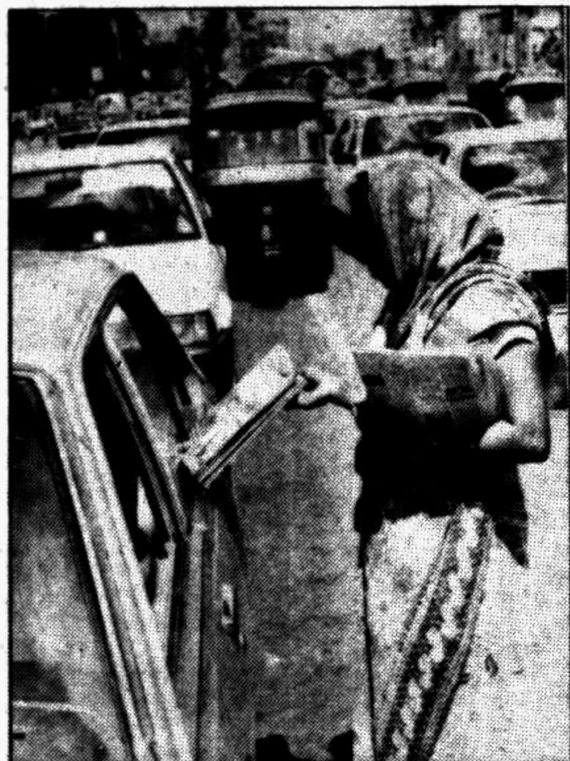
Trying her luck with a car rider.

To this small section belongs Amena, whom I came to know when she pushed a magazine into my hand, when the 'baby-taxi' or the three wheeler I was riding on, had stopped at a traffic light at Maghbazar. Two days later, I happened to be walking past the area. When I saw Amena, once again. Clad in a colourful printed sarce, she was earnestly requesting the passengers to buy at least one copy of any of the magazine she was selling.