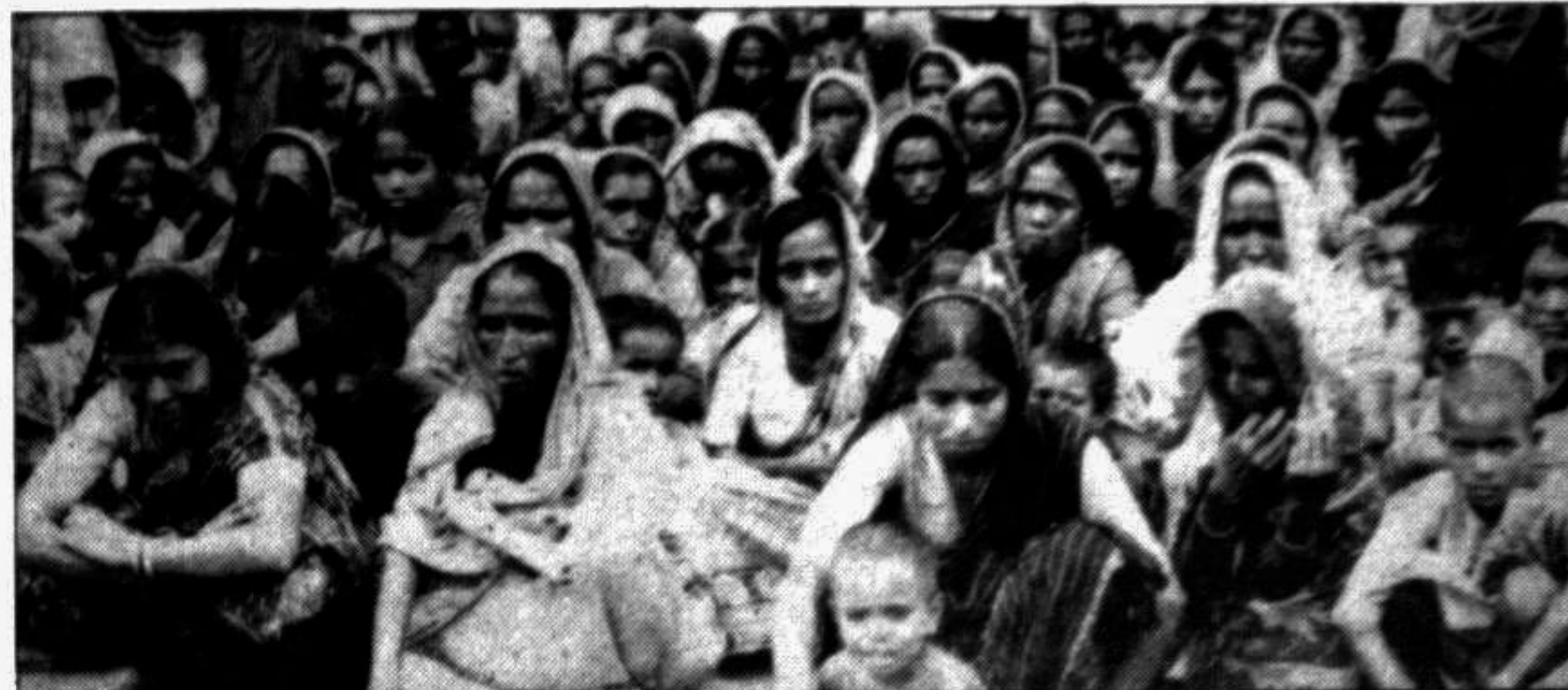
Destitutes in city organised a rally near National Press Club in protest against their eviction.