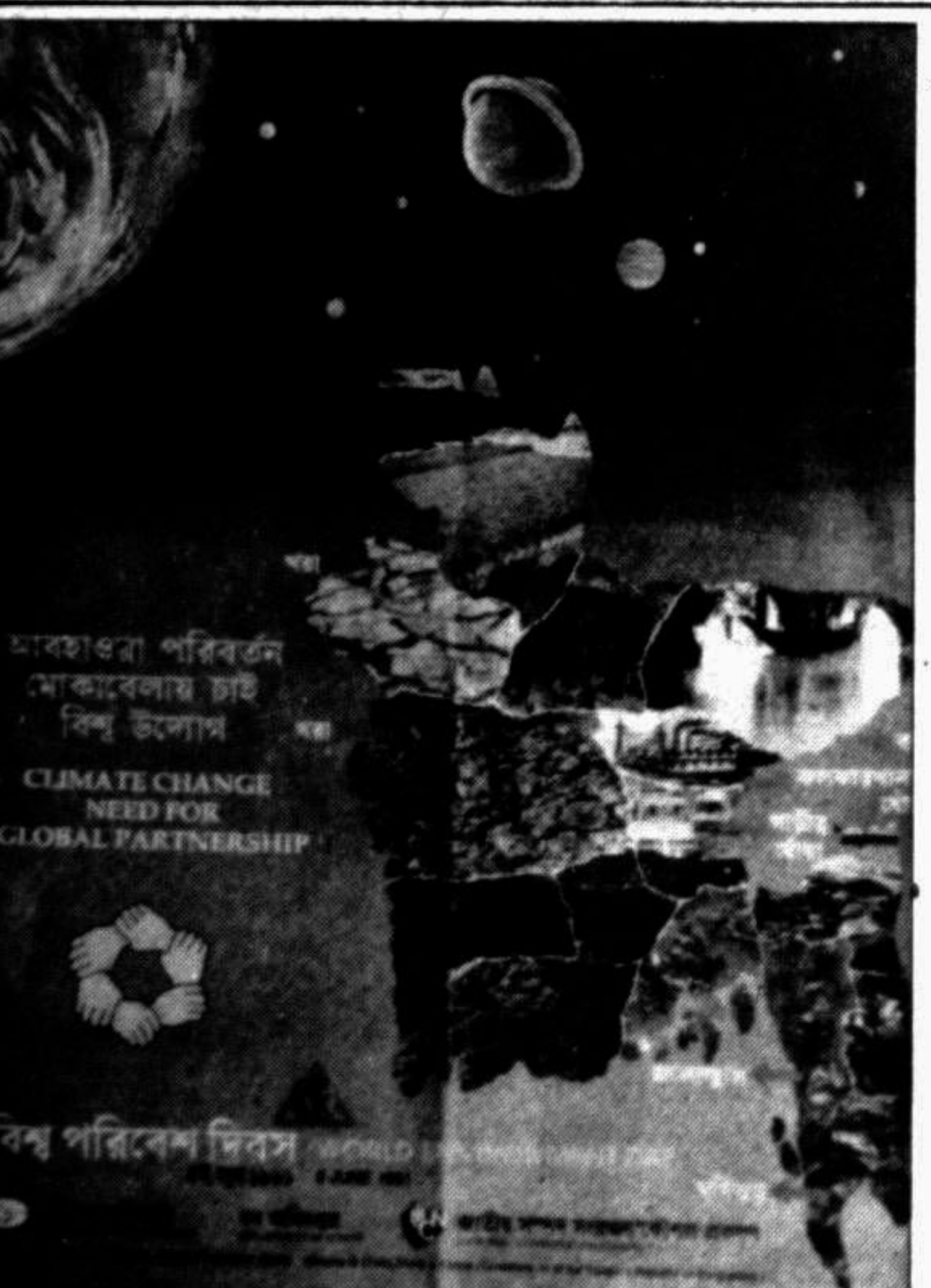
Environment Day poster shows Bangladesh will experience all adverse effects of climatic change — more destructive floods, droughts, cyclones and storm surges — if pollution of the environment continues unabated.

Two other members of the delegation are Prof Khushid Ahmed, Senator and Liaquat Baluch MNA.