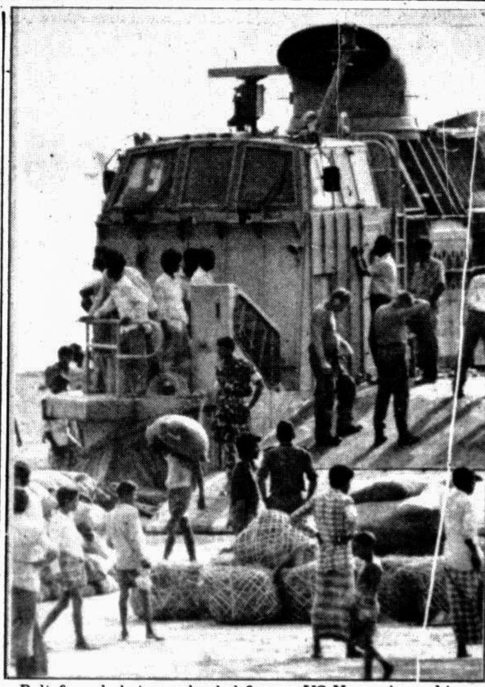
Relief goods being unloaded from a US Navy air cushion landing craft (LCAC) on the island of Sandwip during Operation Sea Angel.