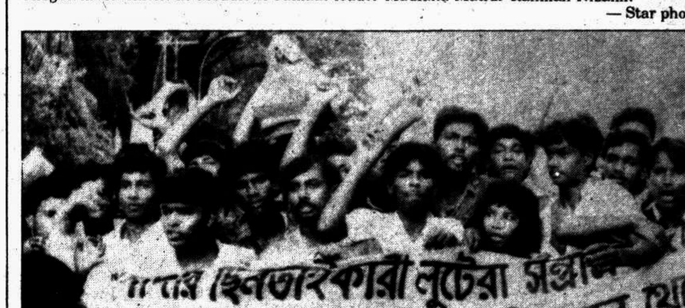
Students of Suhrawardy College brought out a procession in the city demanding arrest of hoodlums to free campus from violence.