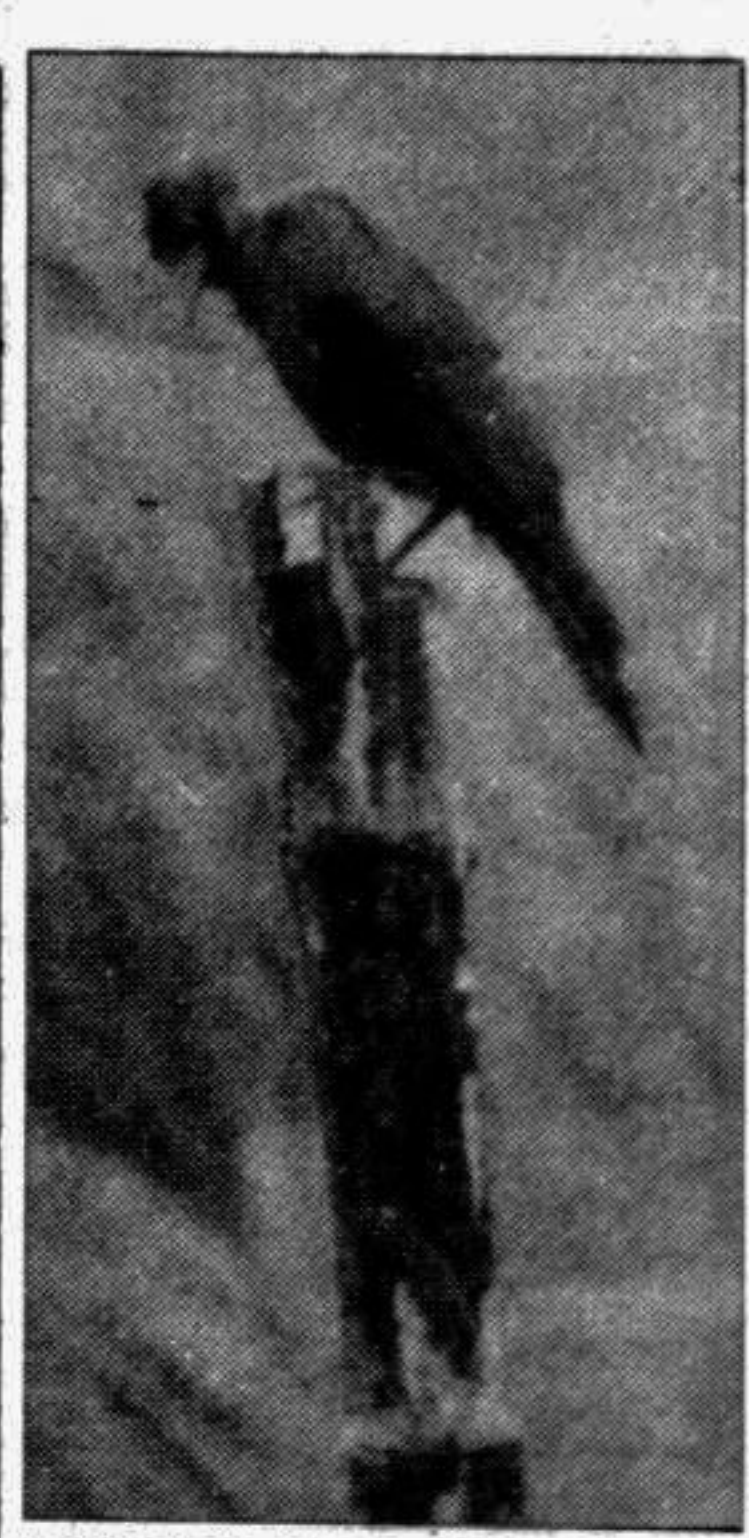
LONELY, WET AND COLD: This fledgling perched on a bamboo stalk weathered the rains and gusts of wind yesterday without budging an inch. Perhaps it just had no other choice.

and asked his countrymen to stop talking about dynastic rule. "What do they think," Rao said when asked to comment on reports that the 106-year-old Congress Party will not survive after Gandhi's assassination and without the political leadership from the Gandhi family. "Where is the talk? Where is the dynasty?" Rao shot back at a news conference, his first since he was chosen by the Congress Party as the presidential