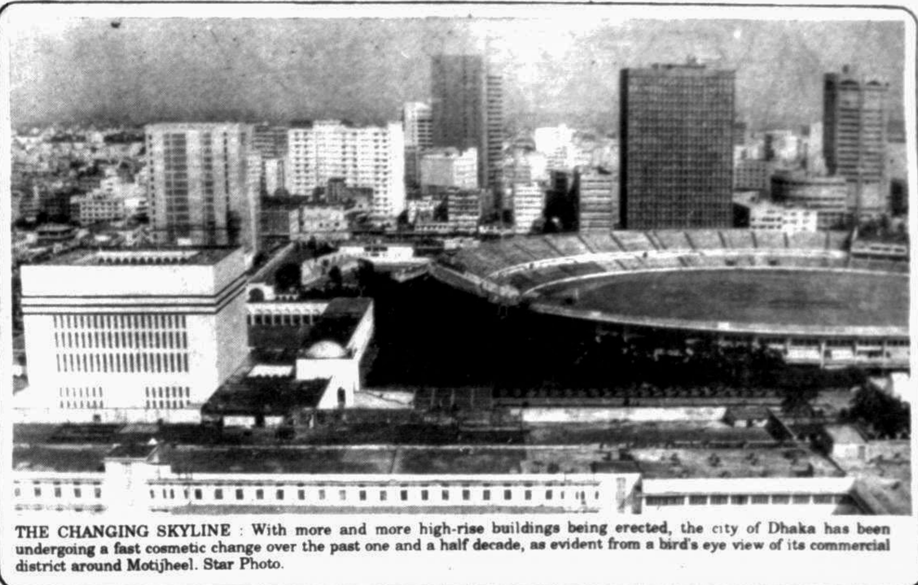
THE CHANGING SKYLINE: With more and more high-rise buildings being erected, the city of Dhaka has been undergoing a fast cosmetic change over the past one and a half decade, as evident from a bird's eye view of its commercial district around Motijheel.

The law we have should protect everyone irrespective of gender — from murder, attempted murder and assault. Woman can go and lodge a complaint at the Nar Nirotan Cell set up at the Ministry for Women's Affairs.