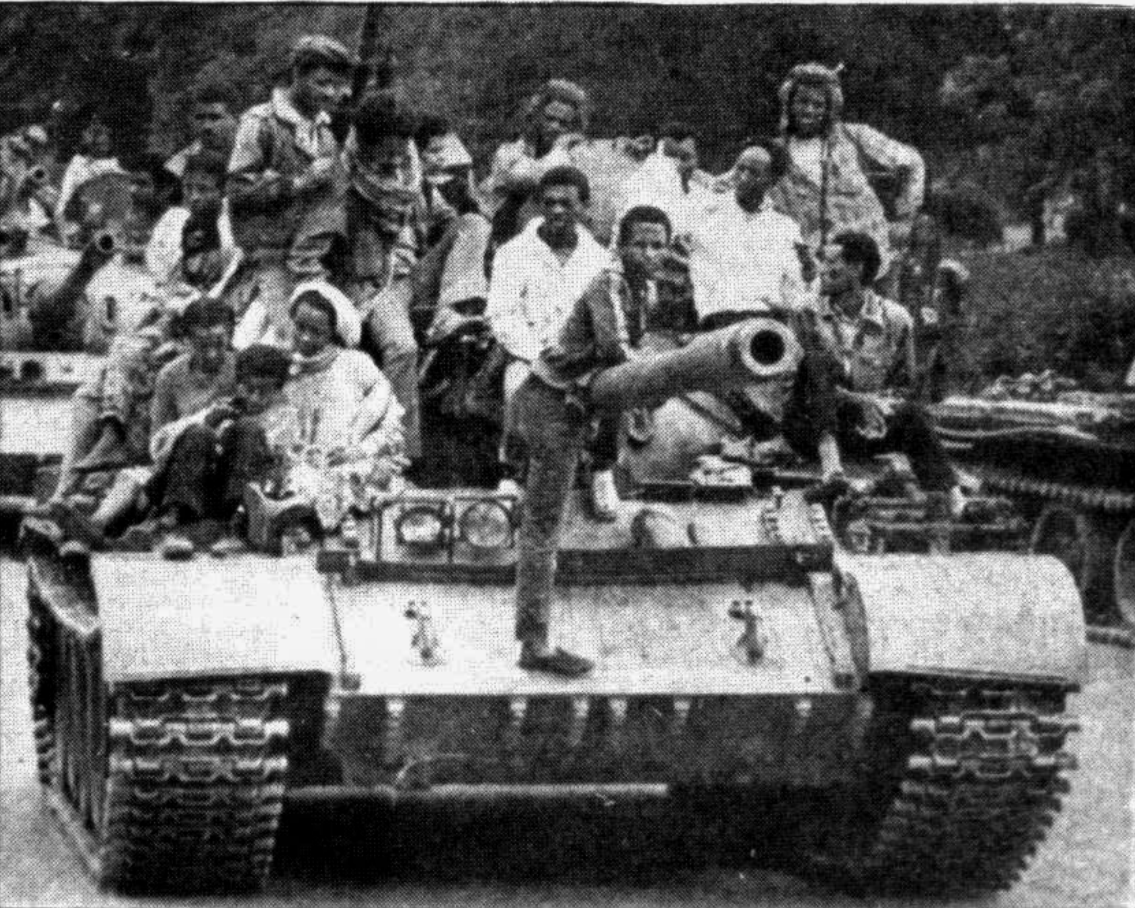
ADDIS ABABA: Ethiopian People's Revolutionary Democratic Front (EPRDF) rebels parade through downtown Addis Ababa May 28 on top of a captured Ethiopian Army tank following their offensive against government troops in the Ethiopian capital.