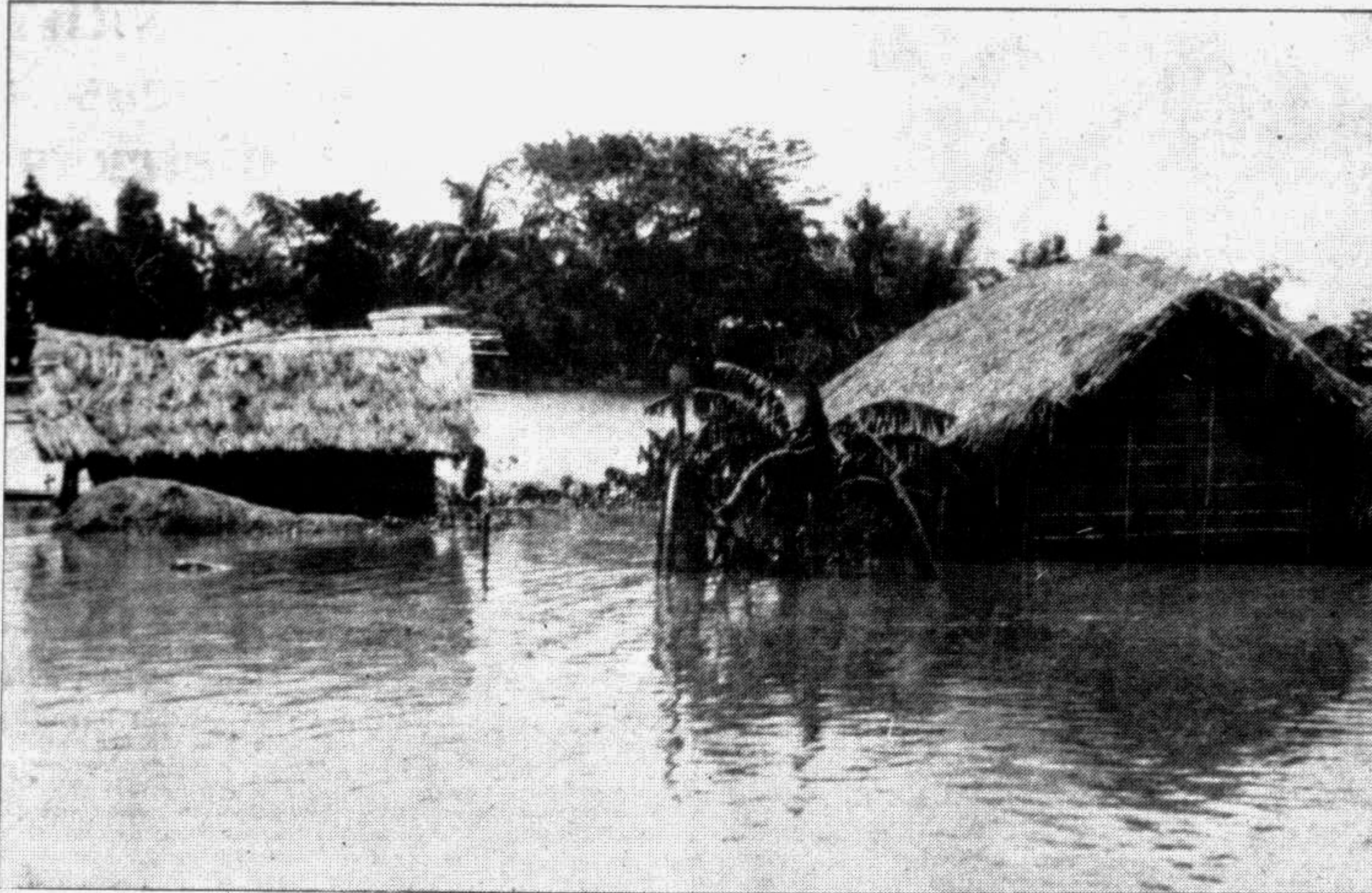
Vast tract of land of Rajanagar Upazila in Maulvi Bazar was inundated following breaches at the Monu dam. Photo shows submerged houses at village Rabta under Panchagaon Union.

Meanwhile, 180 tubewells have already been sunk while the rest are expected to be installed soon.