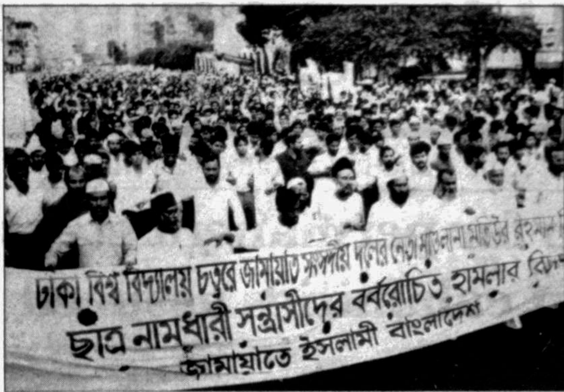
The Jamaat-e-Islami held a protest rally in city on Monday against attack on its Secretary-General Matur Rahman Nazami on the Dhaka University campus in the morning. Story on the incident at Page 1.