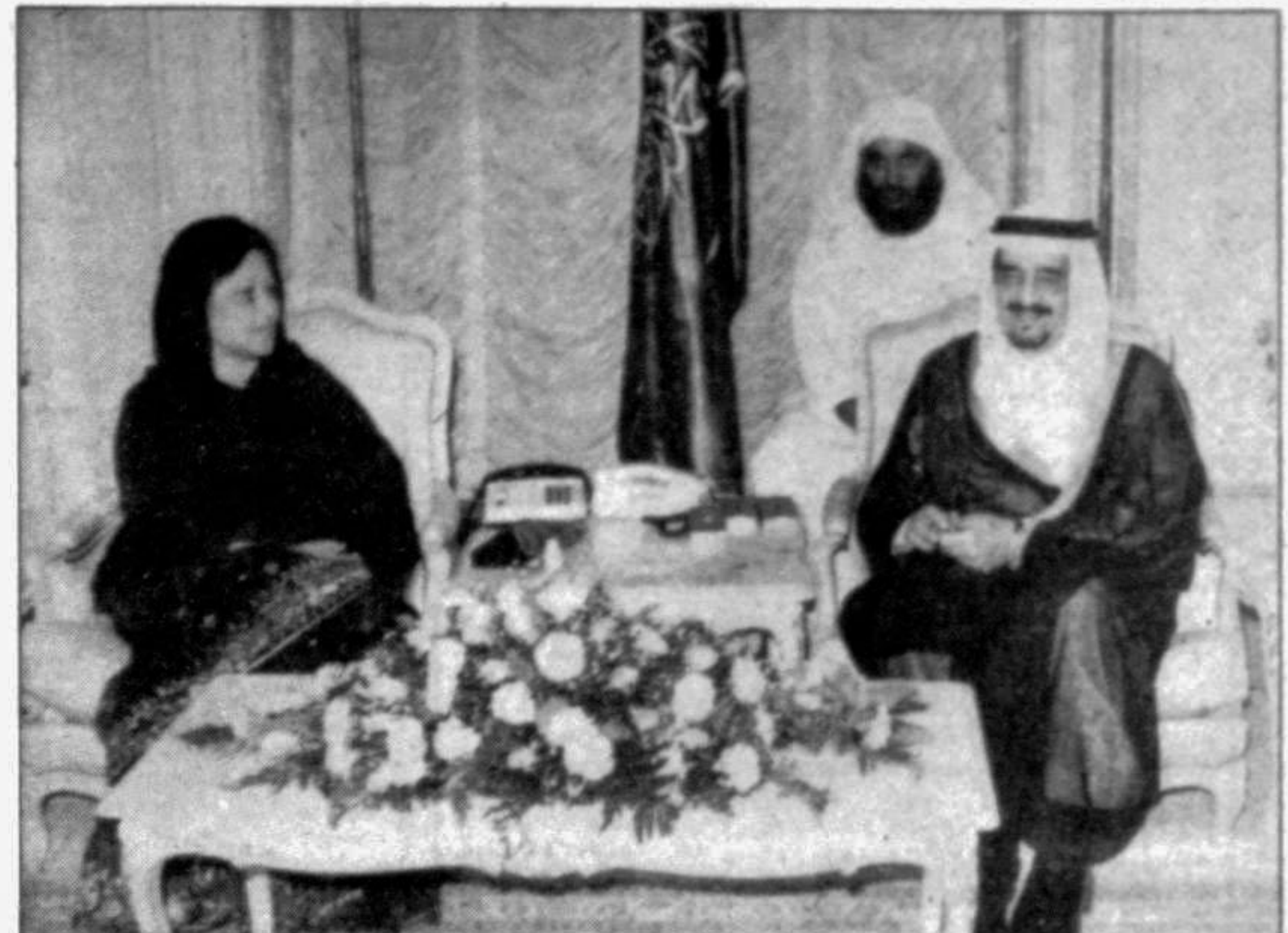
Prime Minister Begum Khaleda Zia and King Fahd holding talks at Yamama Royal Palace in Riyadh on Sunday.

During the meeting, the Saudi side was represented by Foreign Minister, Prince Saud Al Faisal, Defence Minister Sultan Bin Abdul Aziz, high dignitaries and leading members of royal family. Foreign Minister A S M Mostafizur Rahman, State Minister for Labour and Manpower Rafiqul Islam Mian, Shahidul Huq Jamal, MP, Azizul Huq Mollah, MP, Salauddin Ahmed, MP, Rabeya Chowdhury, MP, Foreign Secretary Abul Ahsan and Ambassador of Bangladesh to Saudi Arabia Maj Gen Quazi Golam Dastgir were present on the Bangladesh side. The Saudi Arabian Defence Minister and Second Deputy Prime Minister Crown Prince Sultan bin Abdul Aziz hosted a See Page 10 Col. 5