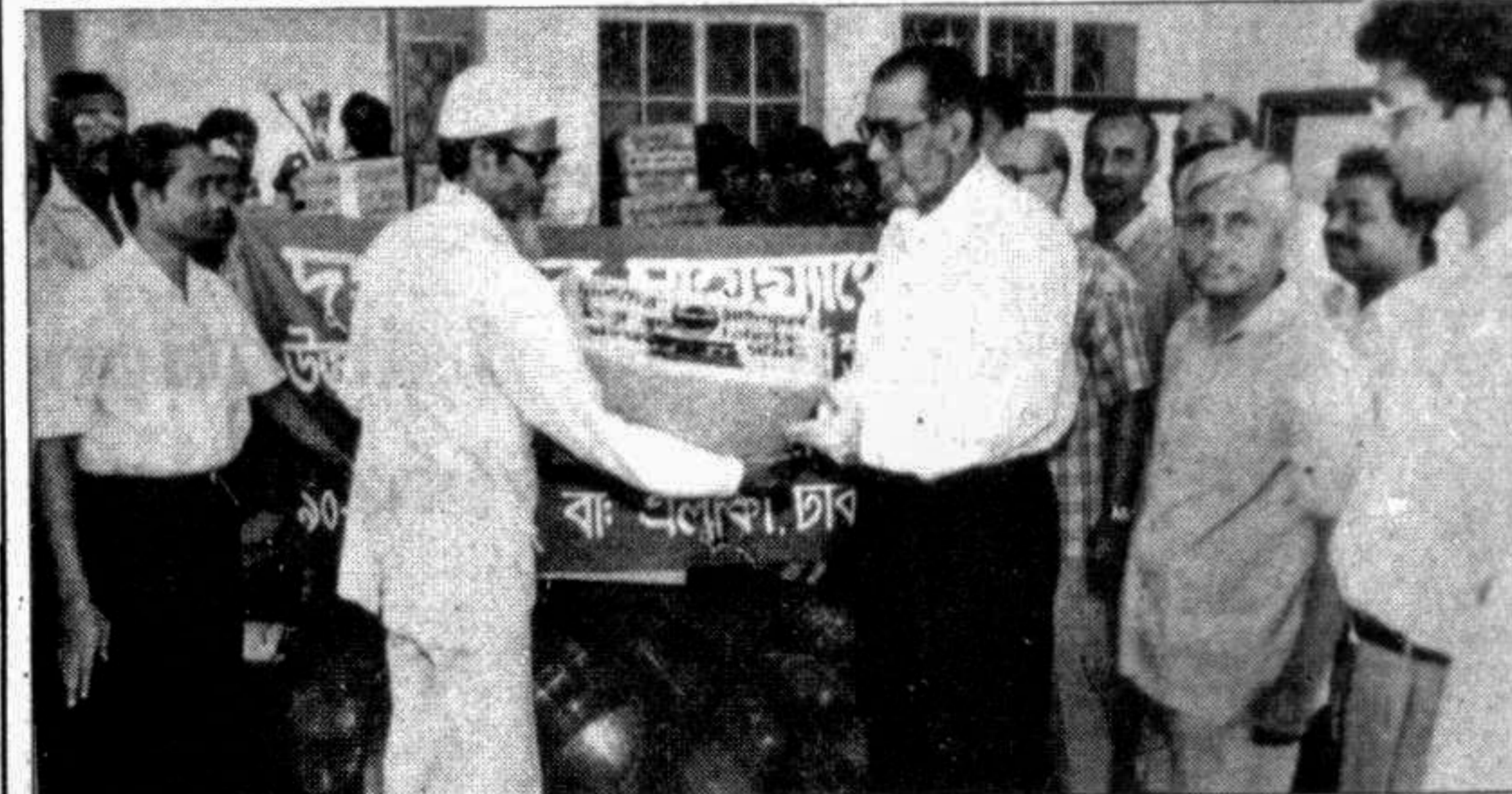
Uttara Bank Officers Association donating huge relief goods to the Bangladesh Red Crescent Society for Cyclone and flood affected people.