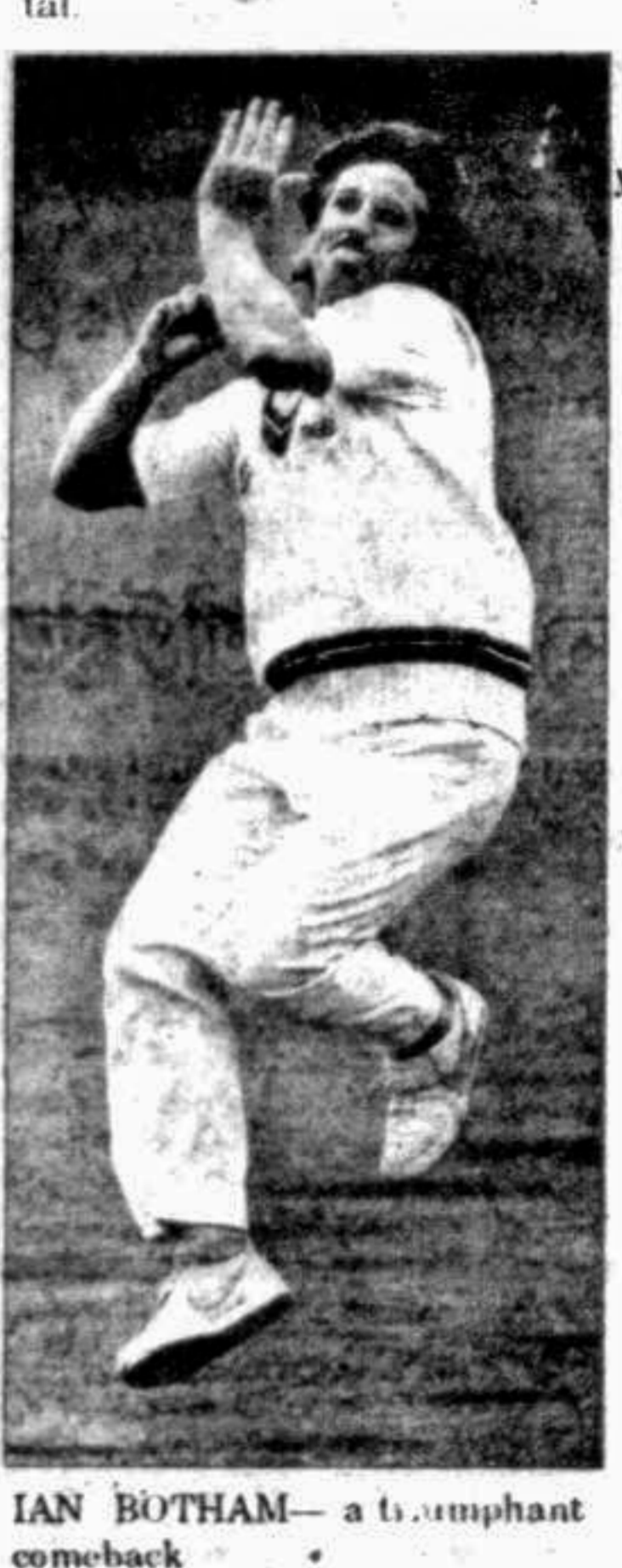
IAN BOTHAM—a triumphant comeback

Ambrose was not out on 21 while his ninth-wicket partner Walsh was unbeaten on 29.