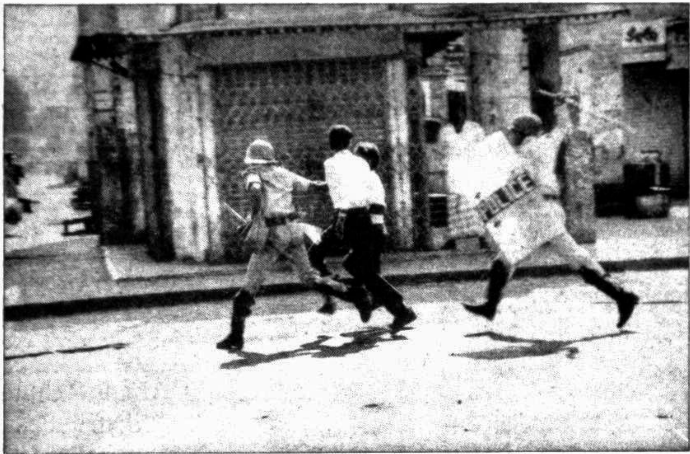
Nov.1990- Repression.