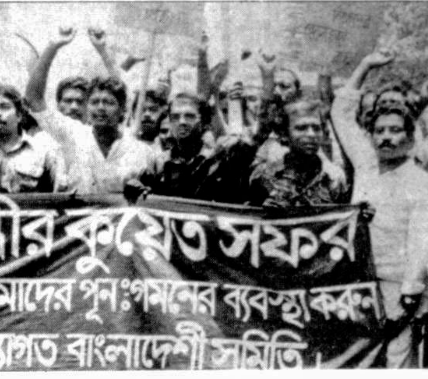
The Kuwaiti returnees holding a rally in city on Thursday calling upon Prime Minister Khaleida Zia, scheduled to leave for S Arabia, Kuwait and the UAE on Saturday, to arrange their, early return to Kuwait.

He was also critical about SAARC's failure in promoting concrete activities like joint venture and socio-economic cooperation.