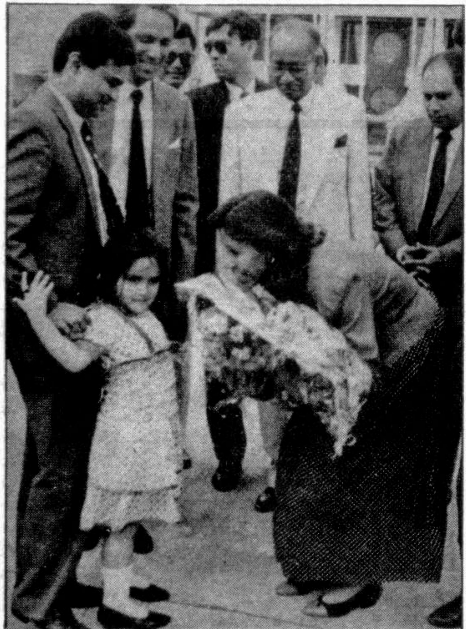
Mrs Marilyn Quayle saying goodbye to a kid who offered her a bouquet at Zia International Airport prior to her departure on Thursday.