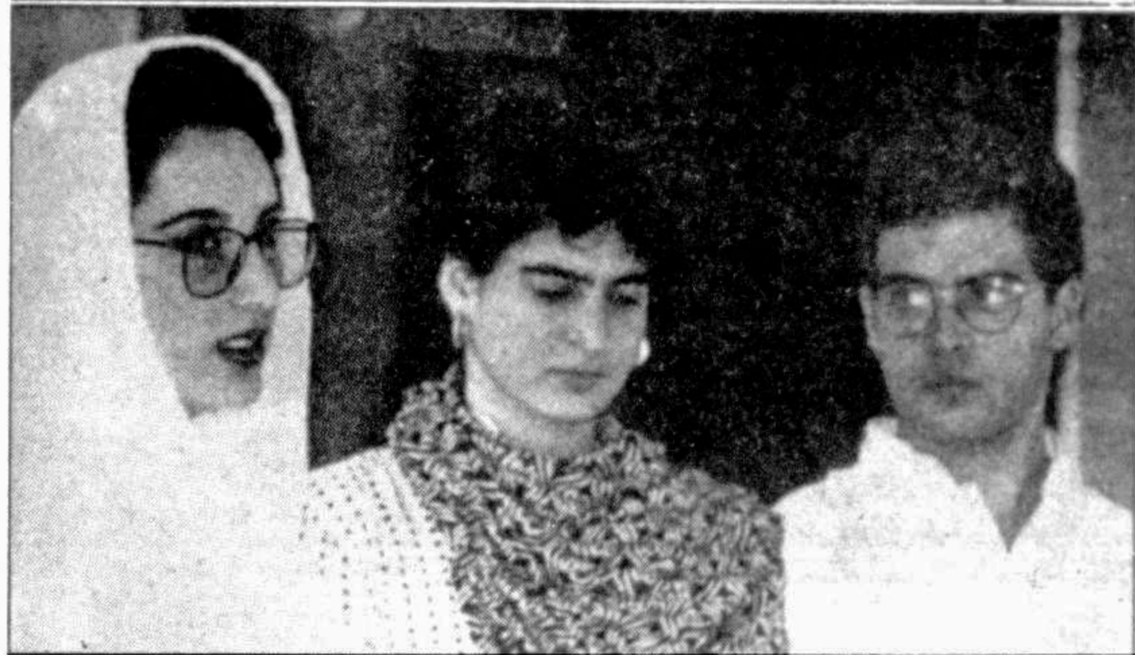
TOP: Indian Prime Minister Chandra Shekhar (right) holds hand to head and stands with President Venkataraman (right) on Wednesday as the coffin bearing remains of Rajiv Gandhi arrive in New Delhi. BOTTOM: Former Pakistani Prime Minister Benazir Bhutto offers condolences to Priyanka (centre) and Rahul Gandhi (right), daughter and son of Rajiv on Thursday at the late leader's residence.