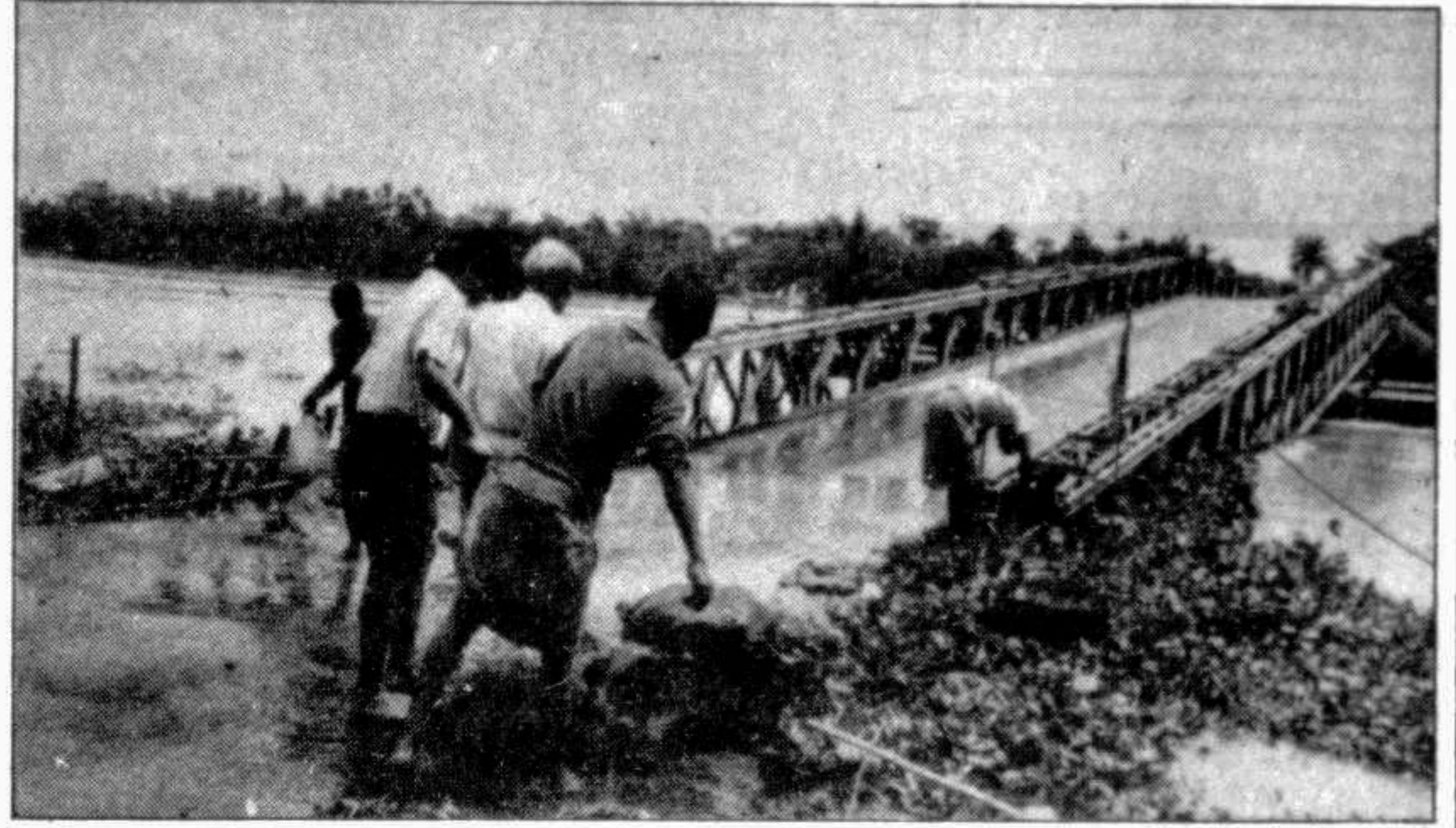
Flood waters threaten a bailey bridge at Sadipur on Sylhet-Dhaka highway.

The affected people were See Page 10 Col. 6