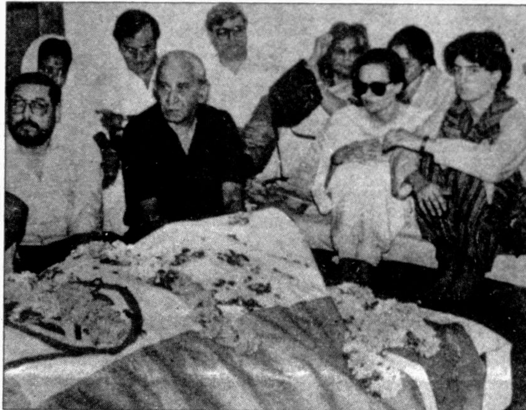
Sonia Gandhi (with sunglasses) and daughter Priyanka (right) are seated before the coffin bearing the remains of former Prime Minister Rajiv Gandhi Wednesday.

NEW DELHI, May 22: A dazed nation Wednesday mourned former Prime Minister Rajiv Gandhi, whose assassination has struck at the roots of India's unruly democracy, report agencies. "It is a serious threat to