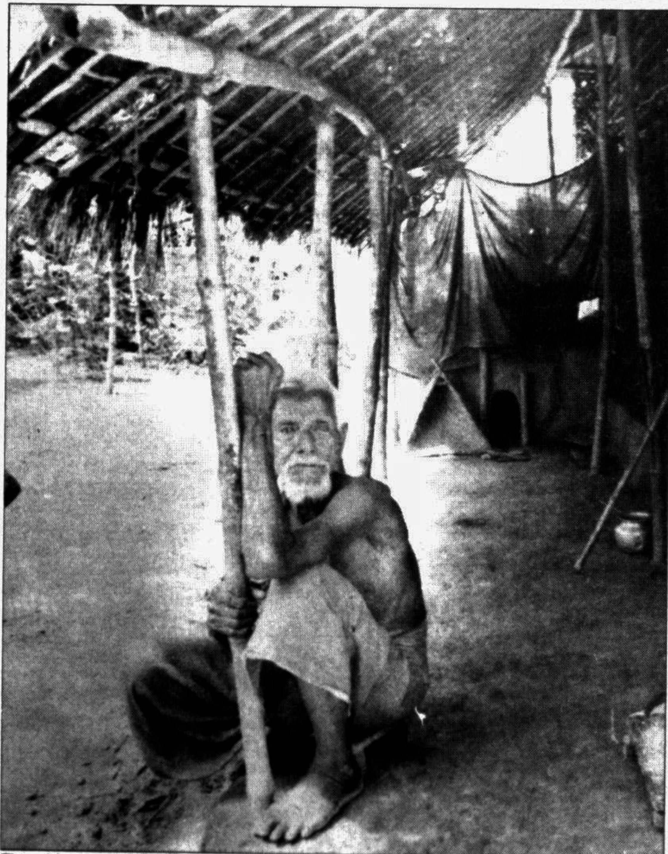
This old man is left all alone in the world. Lightning killed his wife and three grandchildren at village Panchpara in Trishal under Mymensingh district recently.

It is learnt that BADC will import seeds and fertilizers under the Agriculture Rehabilitation Programme.