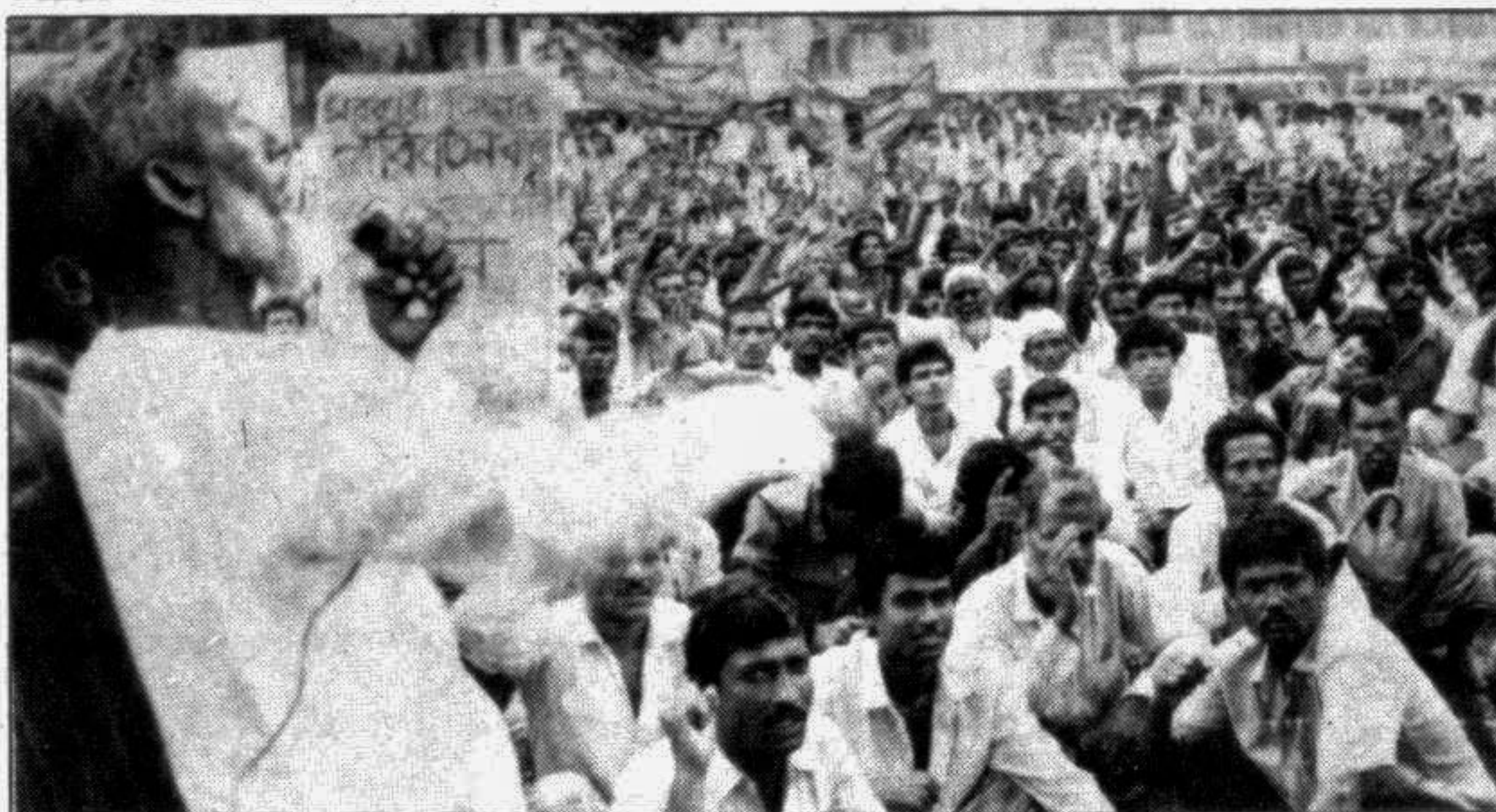
Boat workers holding a rally near National Press Club to press home their demands on Tuesday.