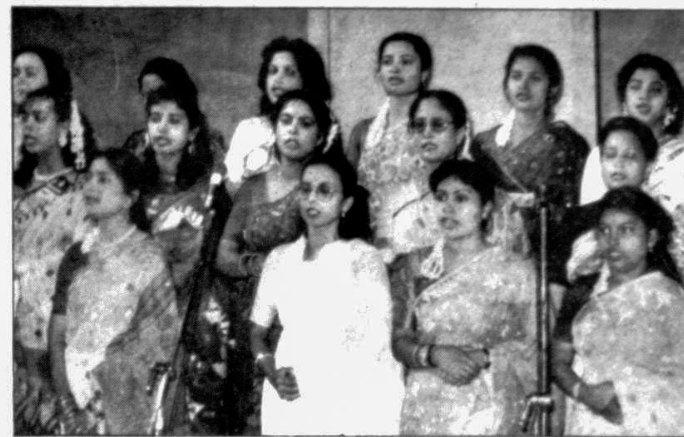
Artistes of Nazrul Academy rendering songs at the National Museum to raise funds for the cyclone-hit people.

Bangladesh Scouts, under their one-month relief activities, has been taking part in