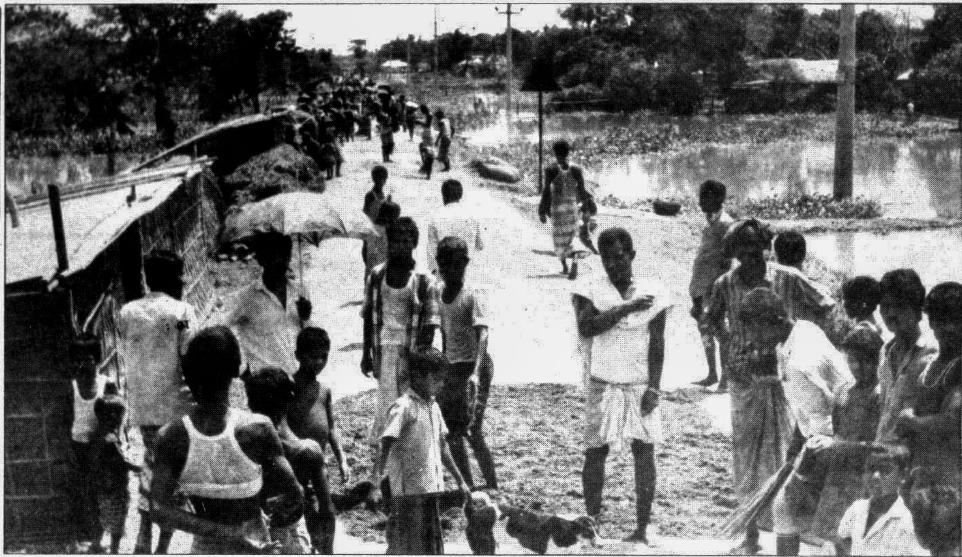
Flood affected people have taken shelter on an embankment at Maulvi Bazar