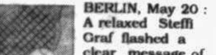
Berlin, May 20: A relaxed Steffi Graf flashed a clear message of intent to her rivals on Sunday with a devastating performance in the semifinals of the German Open, reports Reuter.

Perhaps the happiest footballer of the day, however, was Juventus striker "Toto" Schillaci, who broke his six-