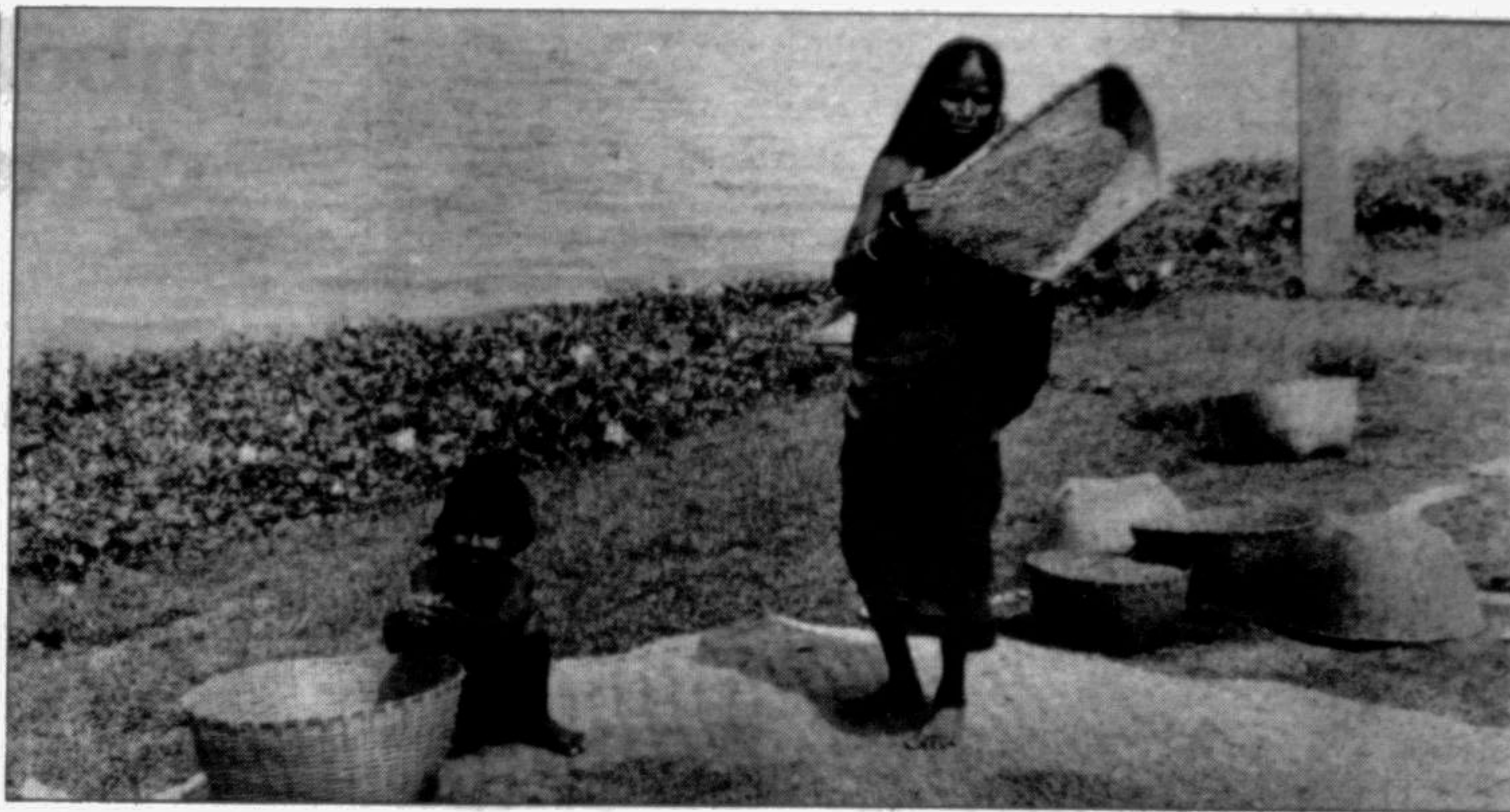
CLINGING TO HOPES: An old woman, whose family has been rendered homeless by floods in Fenchuganj is drying paddy on a patch untouched by waters.

But the US Government is learnt to have been pressing for signing an agreement which is, according to them, required under the international convention.