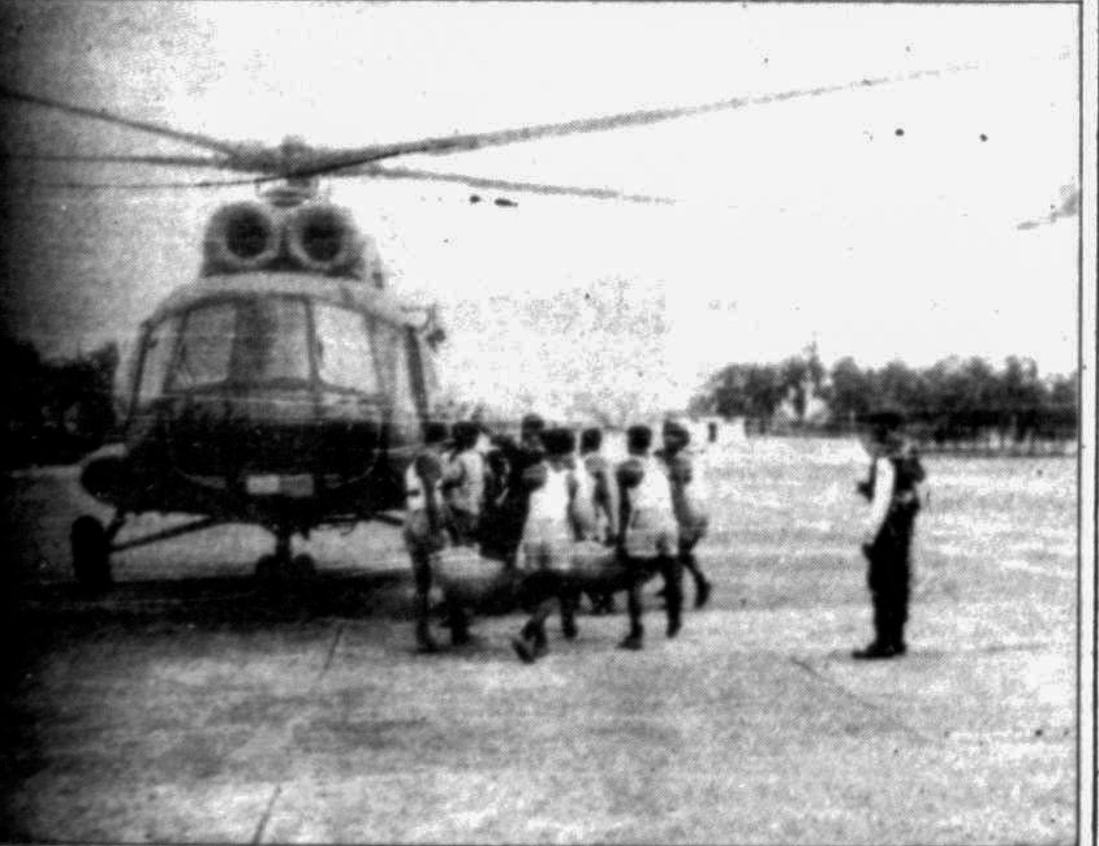
Relief materials being loaded into a helicopter at Chittagong.