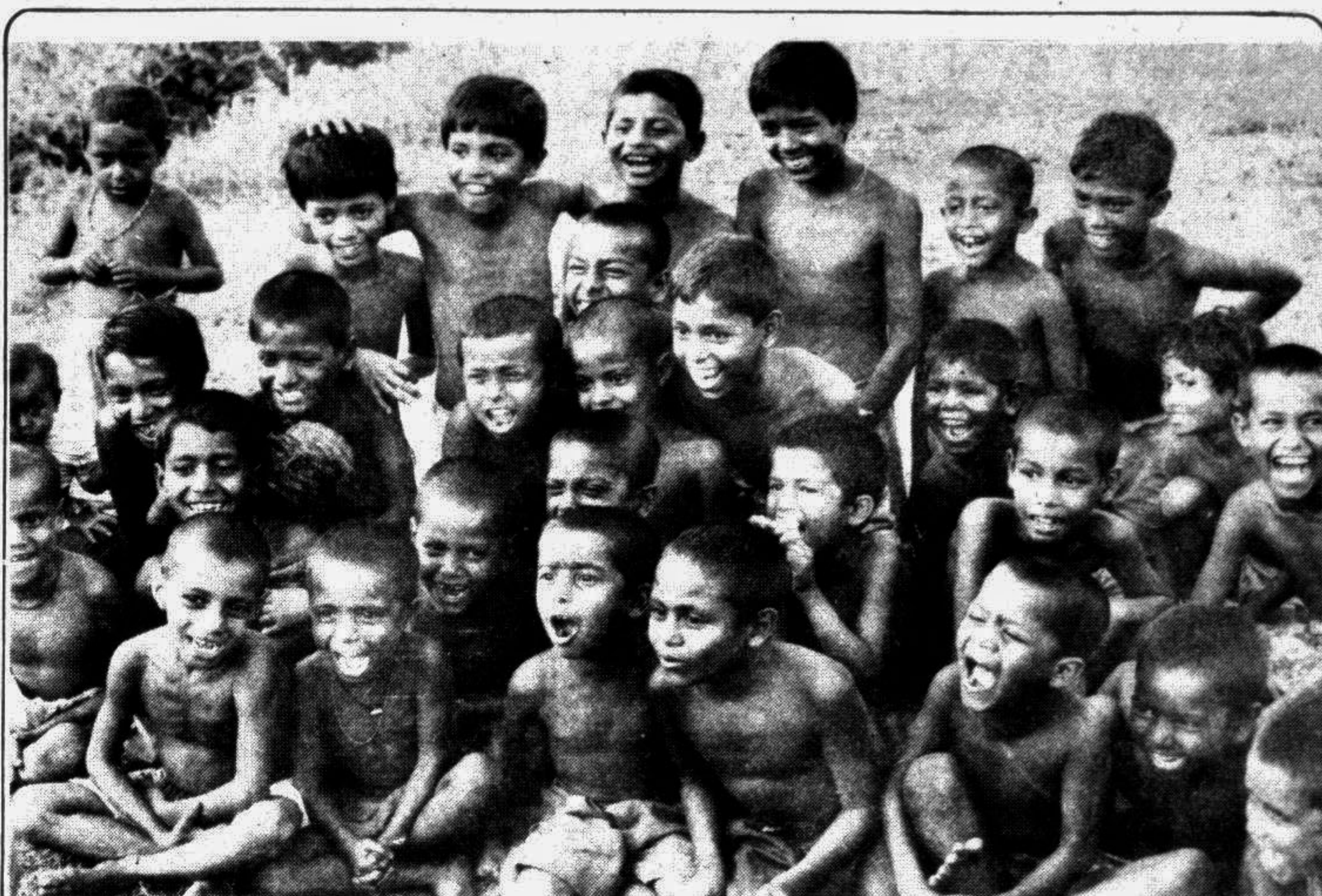
THE SPECTATORS: Excitement run high among a group of street children watching a mock wrestling bout (not shown in the picture) participated by a couple of their friends, at Ramna Park.