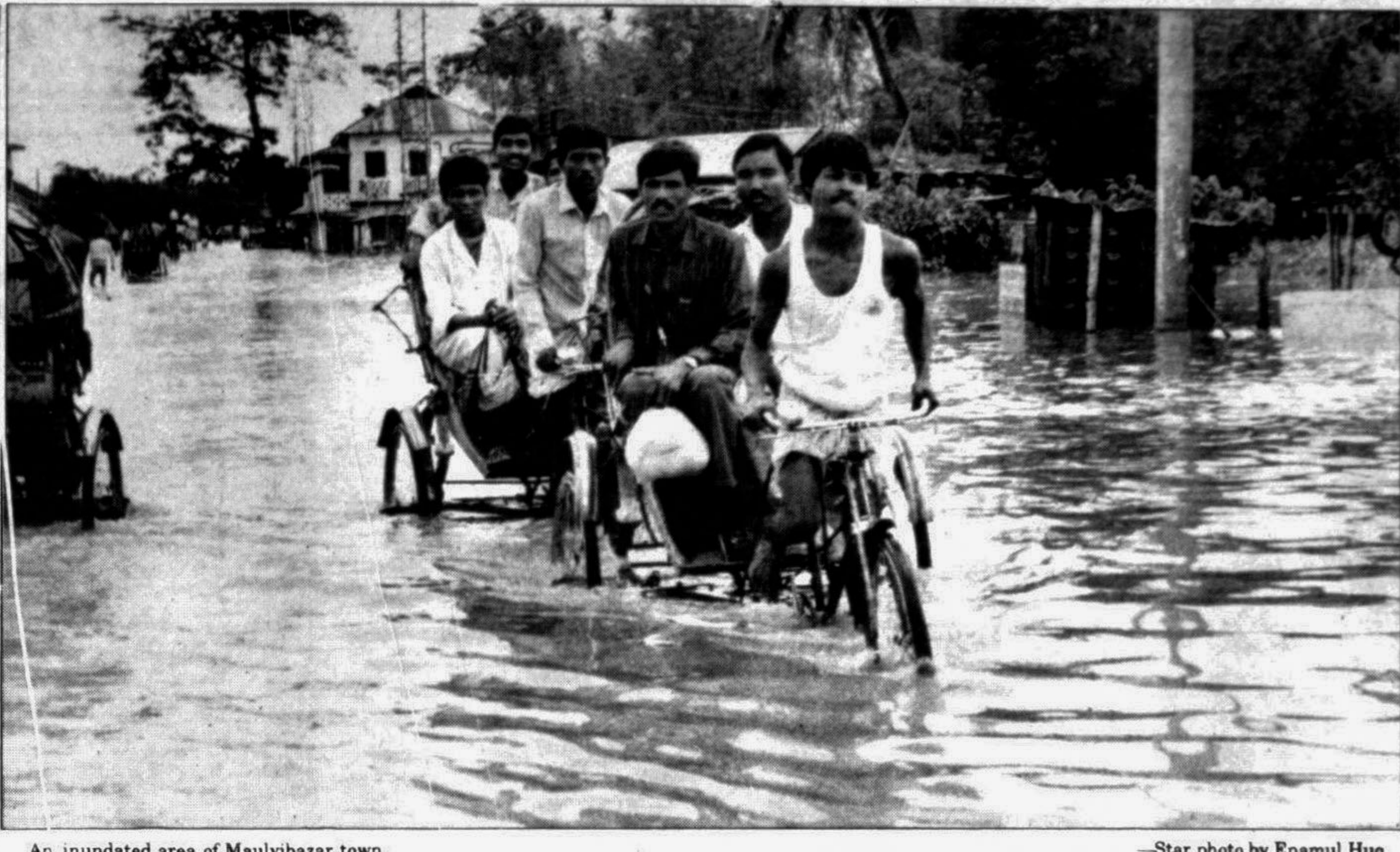
An inundated area of Maulvibazar town.