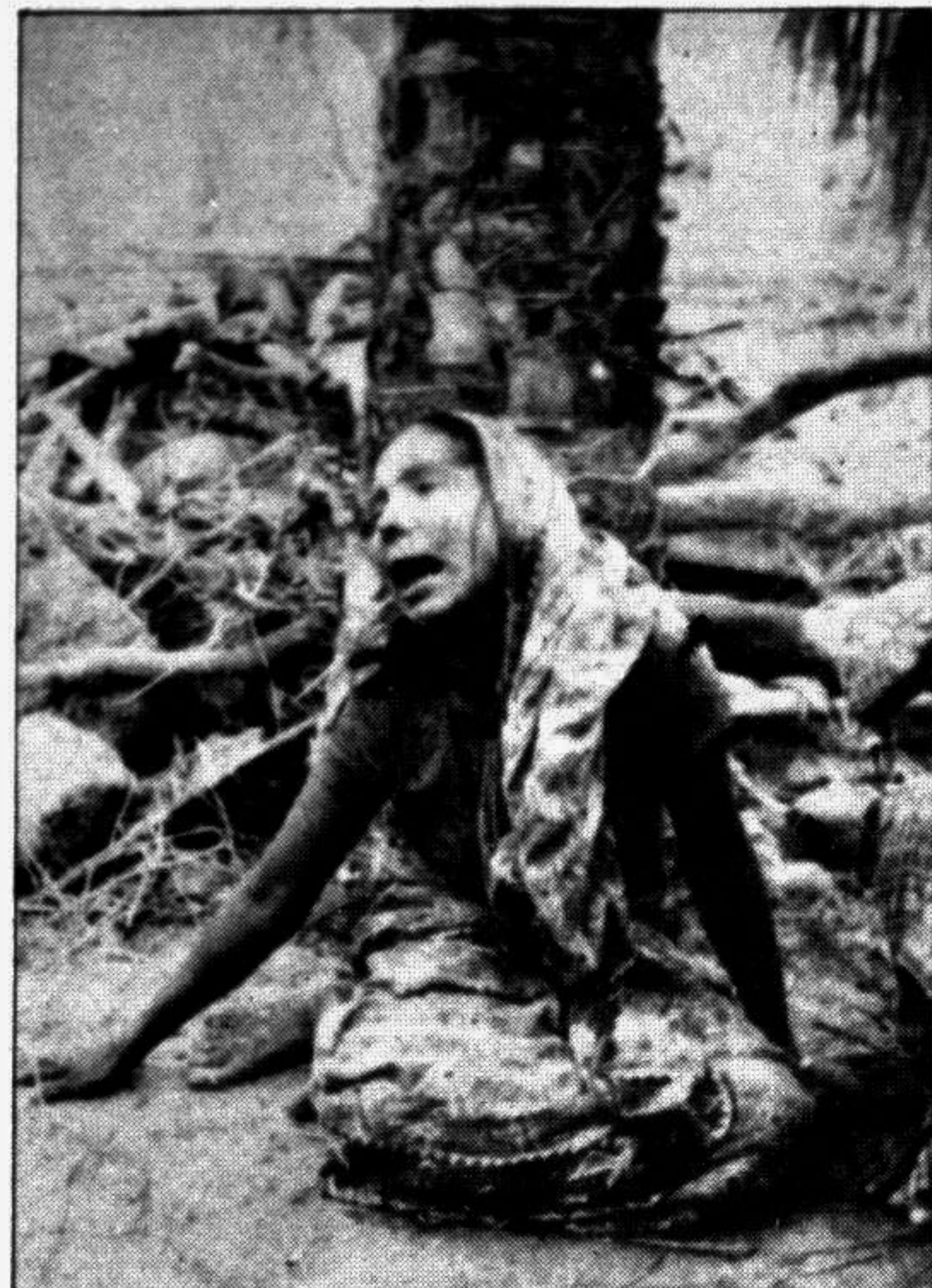
She has lost her family members in the tornado that hit Gazipur recently. Now the woman has very little to do but weeping for near and dear ones at the site of her devastated dwelling.

May 15: Fish fry are being caught indiscriminately in the district despite government ban, reports UNB. According to sources, fingerlings of ruhi, hileha, kot, magur, boal and gazar are being caught rampant from different waterbodies of the district. The government order bans catching of fish below nine inches in length.