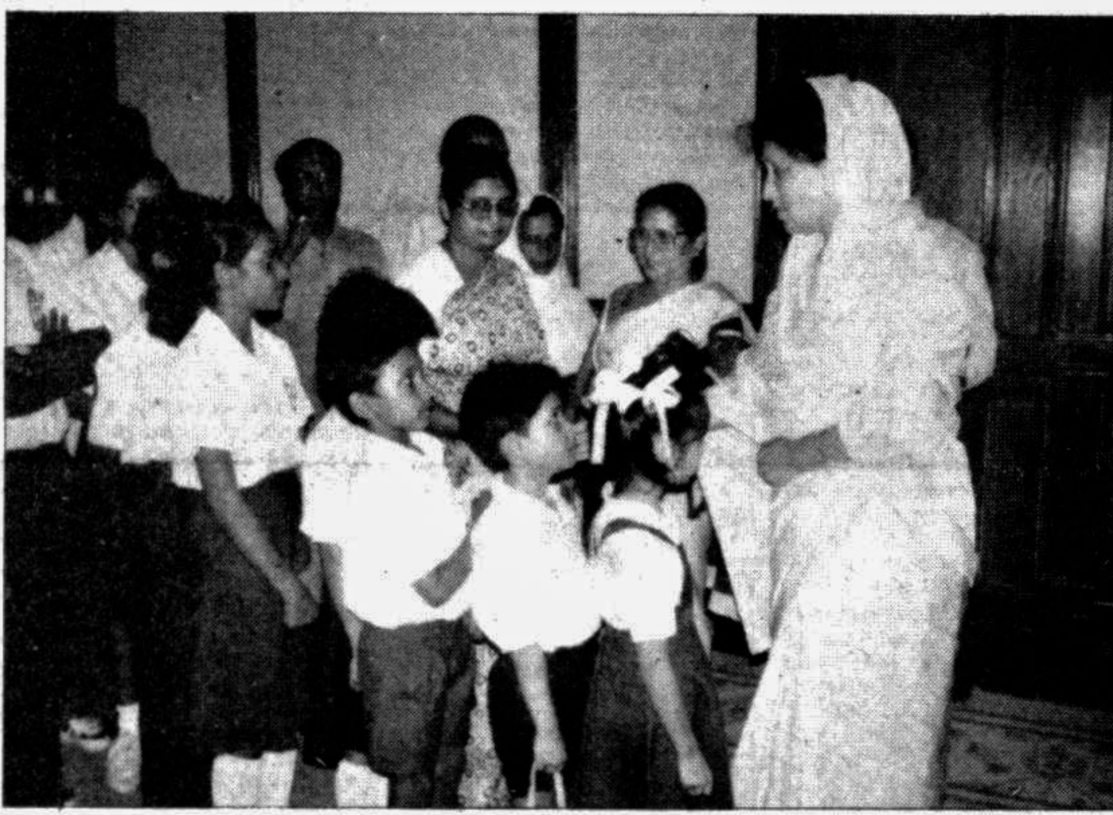
Teachers and students of Scholastica School giving donations to Prime Minister Begum Khaleda Zia for the cyclone victims.