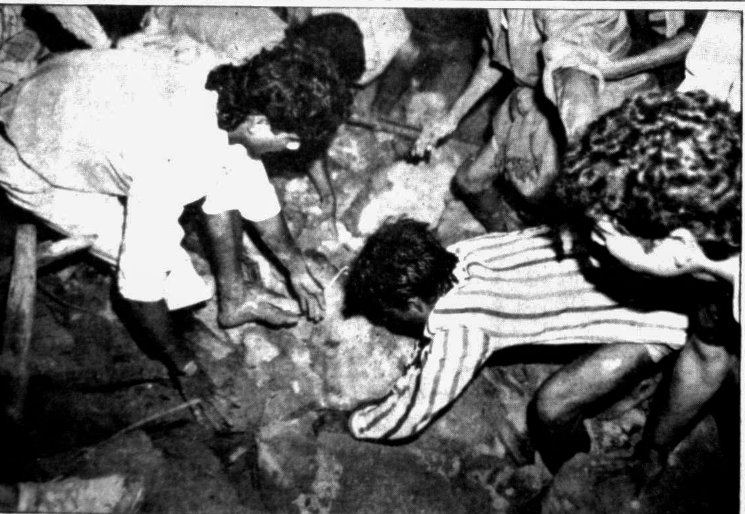
Relief workers removing chunks of debris from a Gazipur village which was hit by a devastating tornado on Tuesday last.

The injured were being treated at Srimangal Sadar