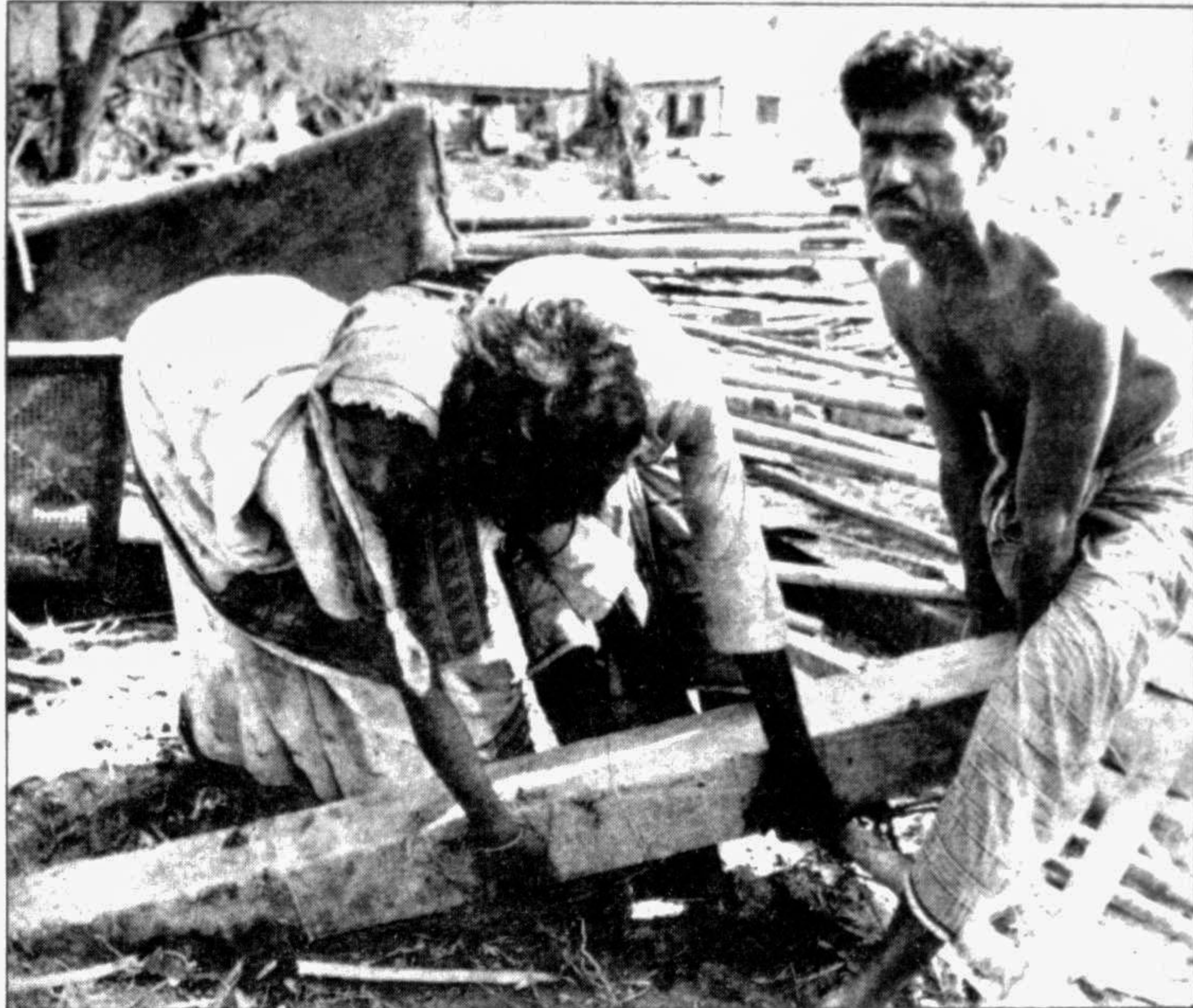
Cyclone survivors with regained will for starting life anew are trying to recover from the debris whatever left to reconstruct their homes.