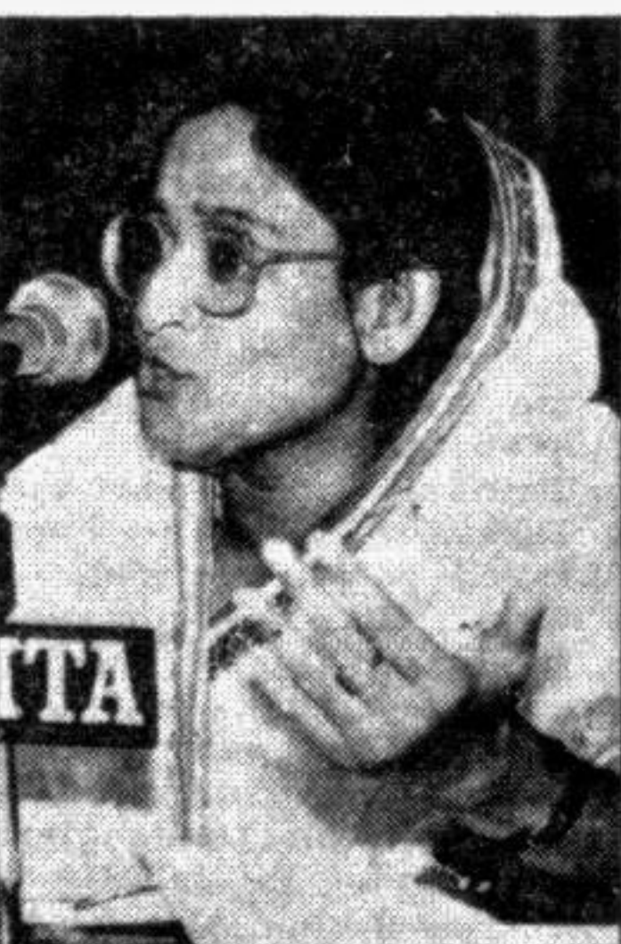
Sheikh Hasina addressing a press conference at the National Press Club Friday

The Leader of the Opposition in parliament, who visited different affected areas, also gave a gloomy picture of the vast coastal areas and described the situation as terrible and disappointing. See Page 10 Col. 1