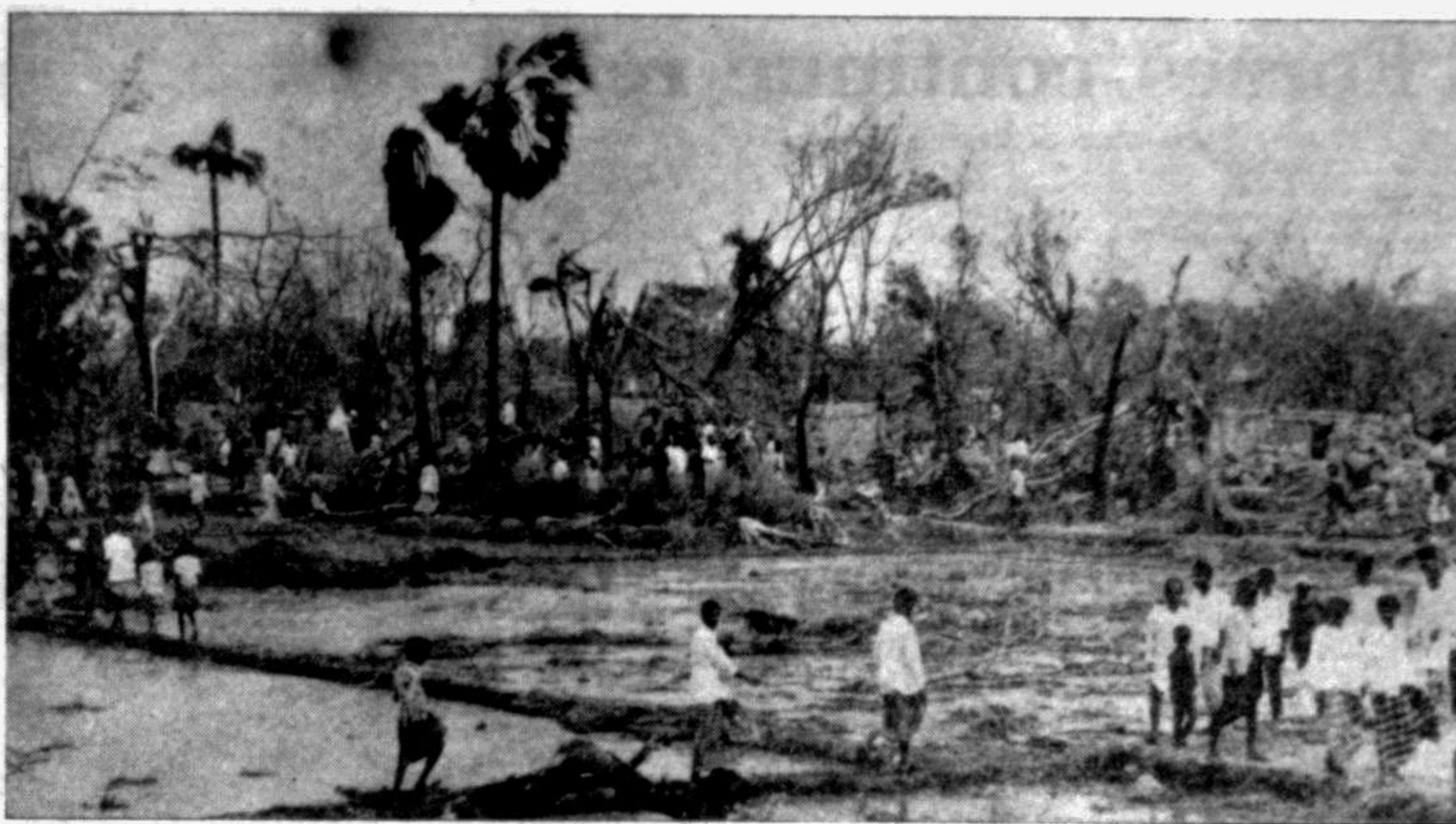
Part of the destruction wrought by Tuesday's tornado in Gazipur.