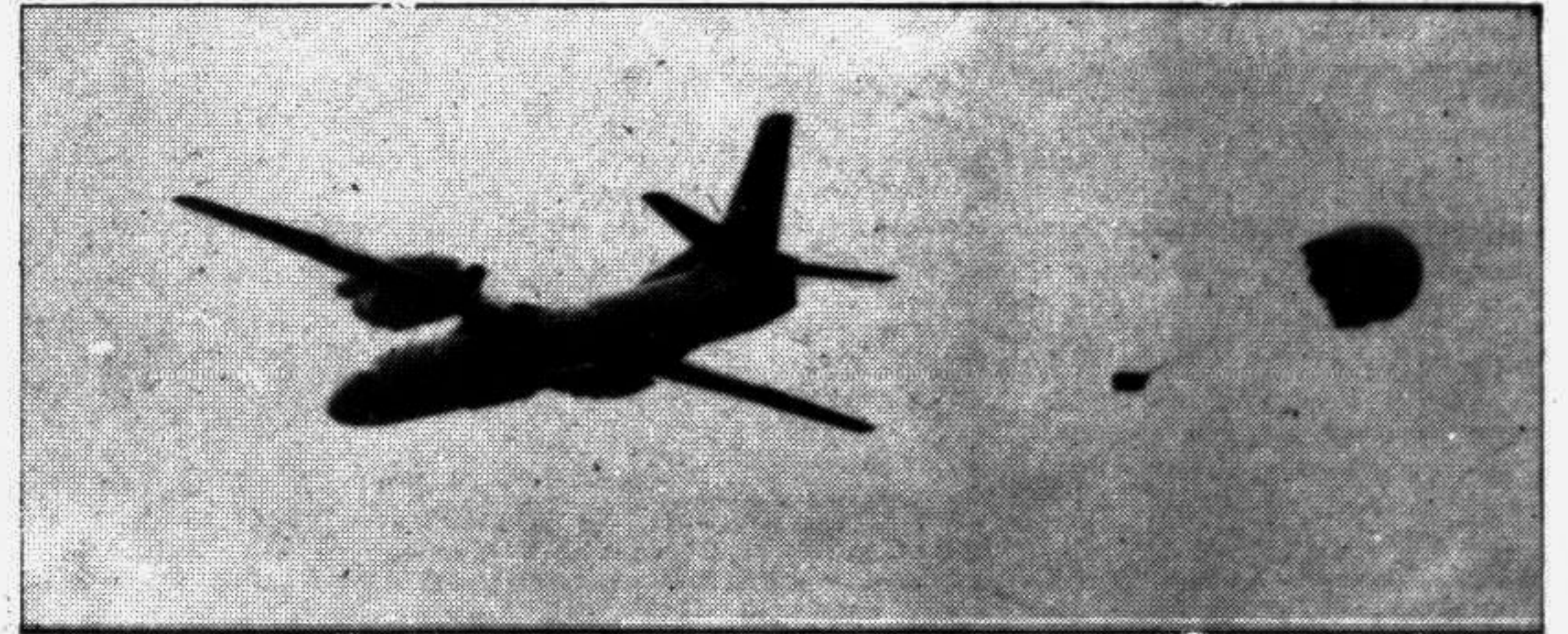
BAF Transport aircraft para-dropping relief goods in the cyclone affected area.