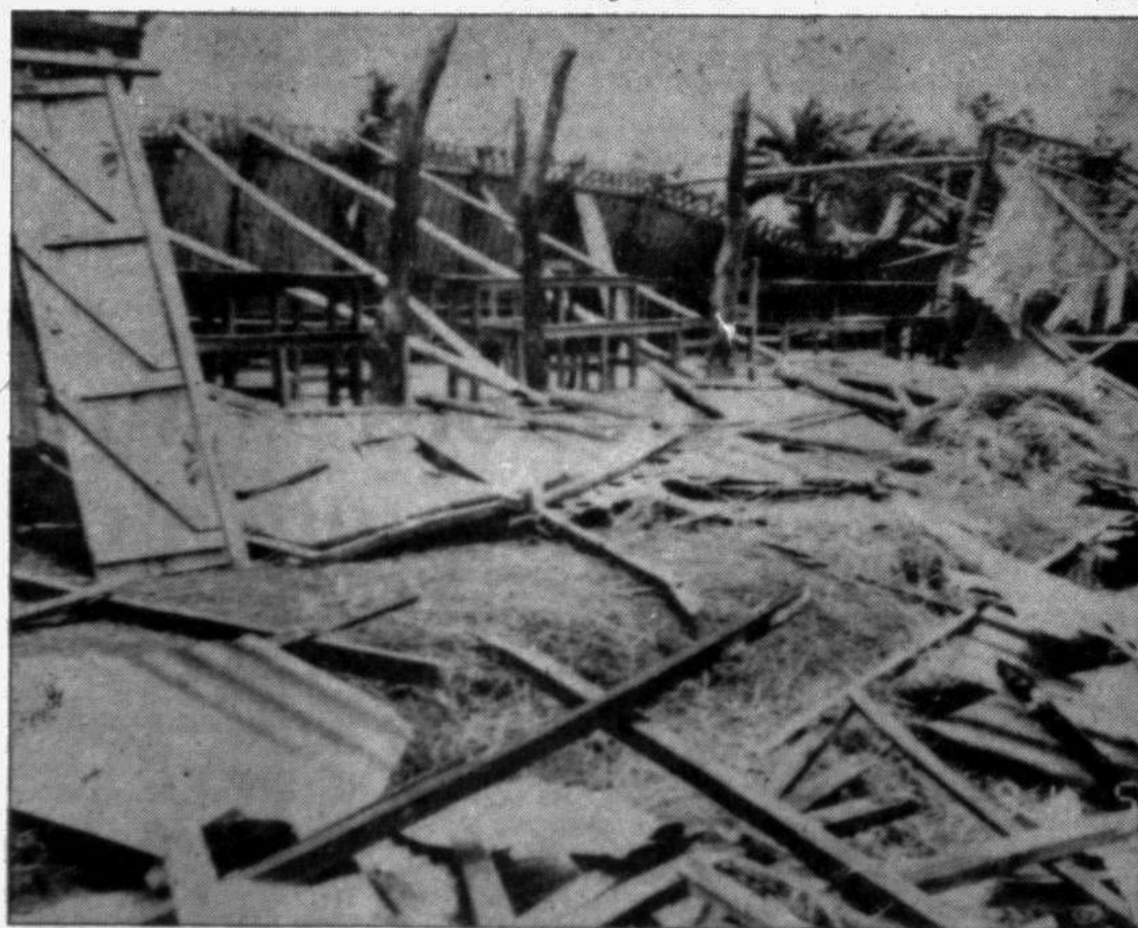
Noakhali: This is how cyclone played havoc with a school at Char Jabbar.

In Hatia, the worst affected part of the district, details of damage to educational institutions is yet to be gathered. However, the district administration recorded damage to 220 schools and madrasahs, among which 150 were totally destroyed and would require reconstruction.