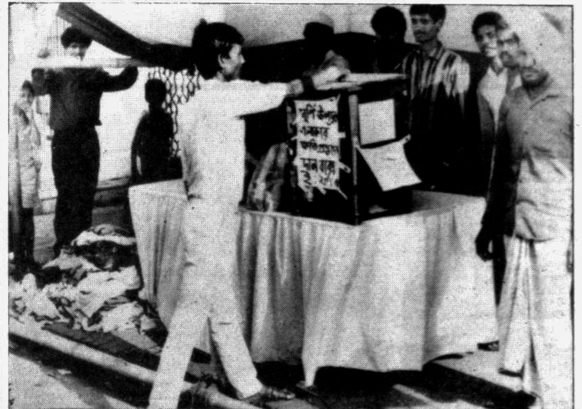
An unemployed youth donating Tk 10 to a voluntary organisation, which set up camps in city to collect funds for the cyclone victims.

Bangladesh Betar Television Shilpi Sangsad has taken a three-day programme to collect relief. The sangsad will organise programme at Mogh-bazar crossing on Wednesday at 3 pm, at Shahab crossing on Thursday from 10 am and at new Market crossing on Friday at 3 pm.