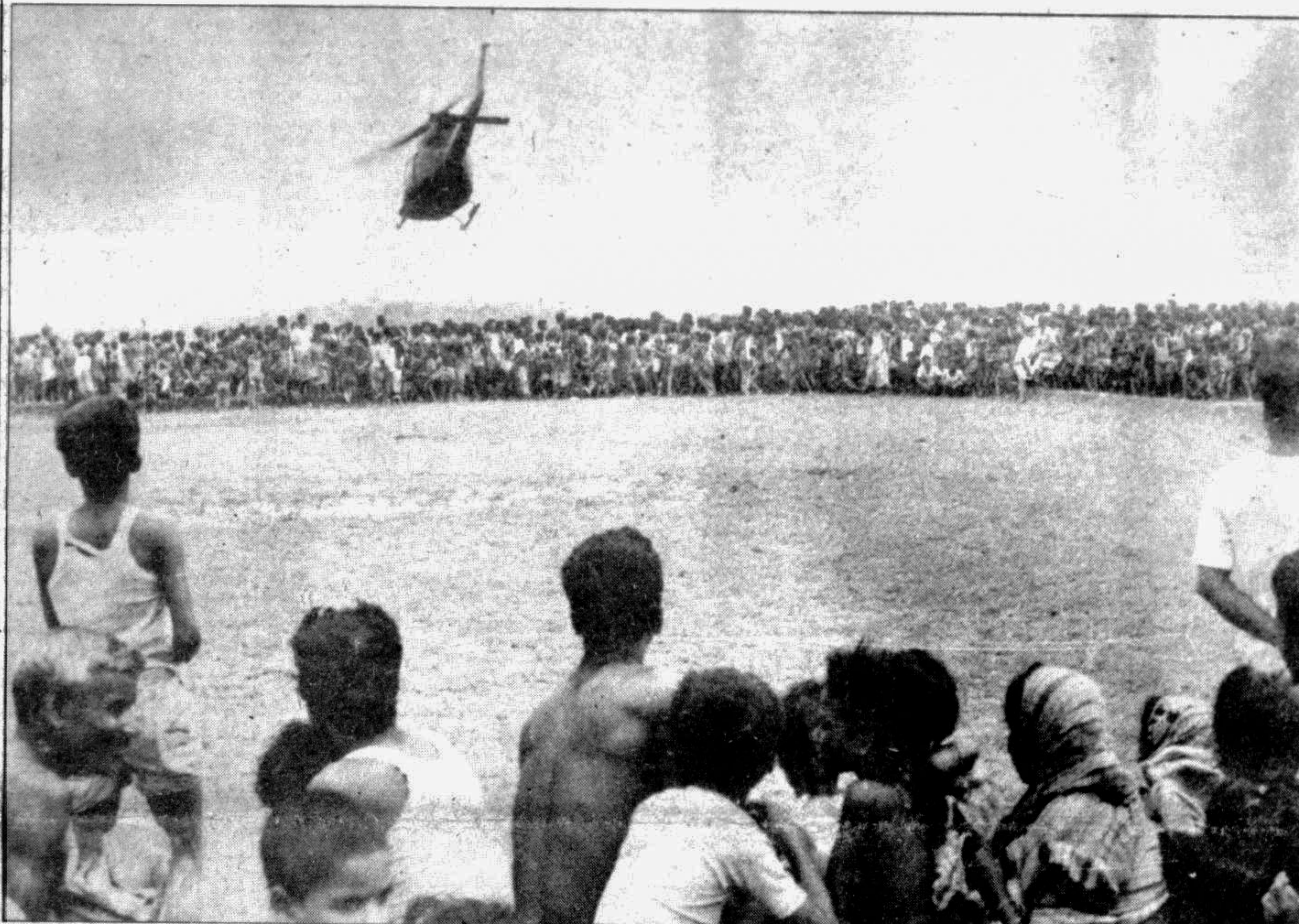
REACHING SUCCOUR: Restive survivors of the cyclone and tidal bore huddle together on the offshore island of Hatiya as an Air Force helicopter with relief tries to land but the chopper's every bid turns to nought as the islanders close in making it to go up and hover over them again Tuesday.