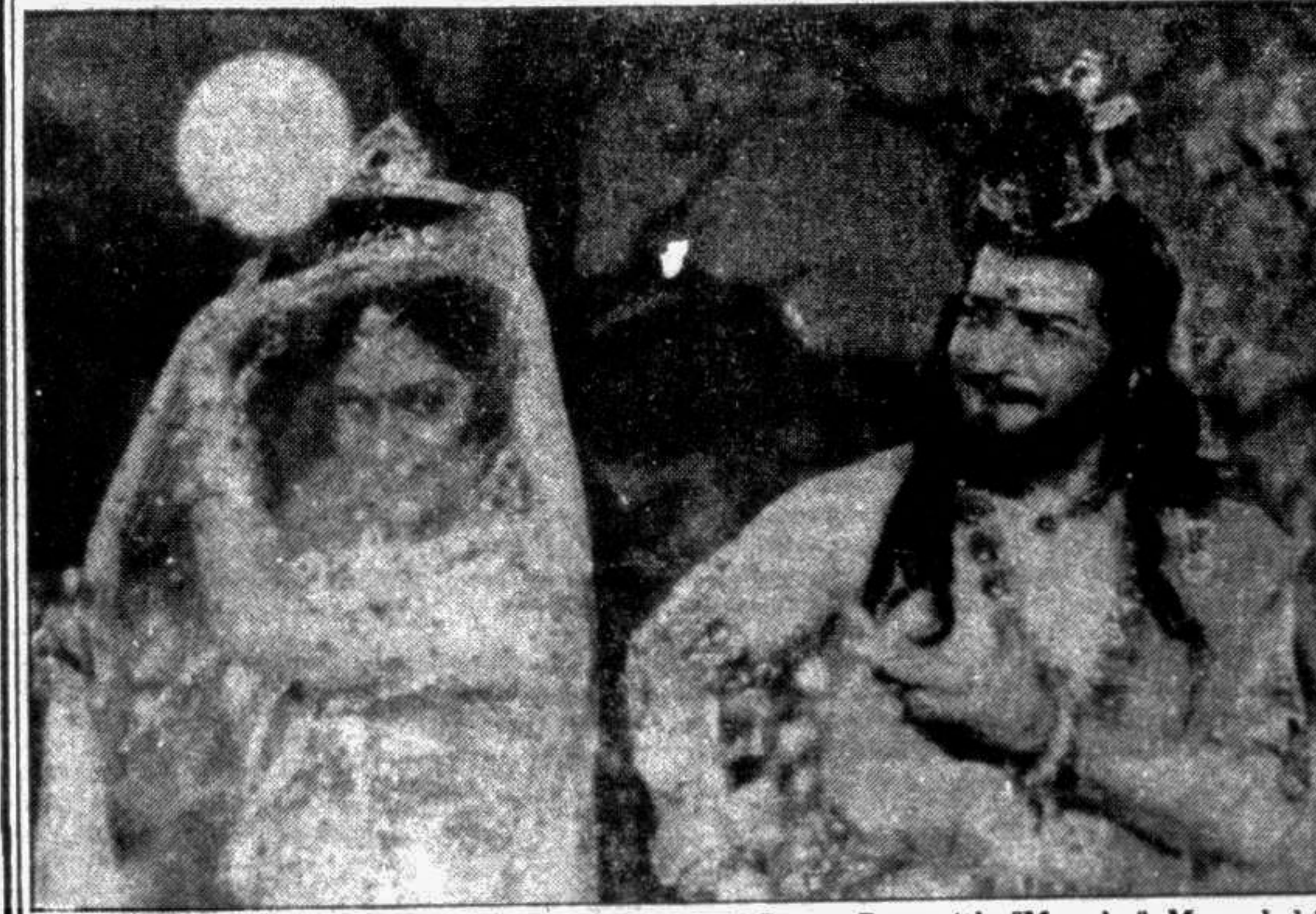
A VOTE-CATCHING TACTIC: "Vishwamitra" Rama Rao with "Menaka" Meenakshi Sheshadri in the Telugu film "Brahmarishi Vishwamitra"

Rama Rao however insists 'Brahmarishi Vishwamitra' has nothing to do with politics or the elections. Its release at this time was nothing but a coincidence. But few have forgotten the gala launch of the film in June 1989 when a battery of National Front leaders had descended on his Nachram studios for the Muhurat shot.