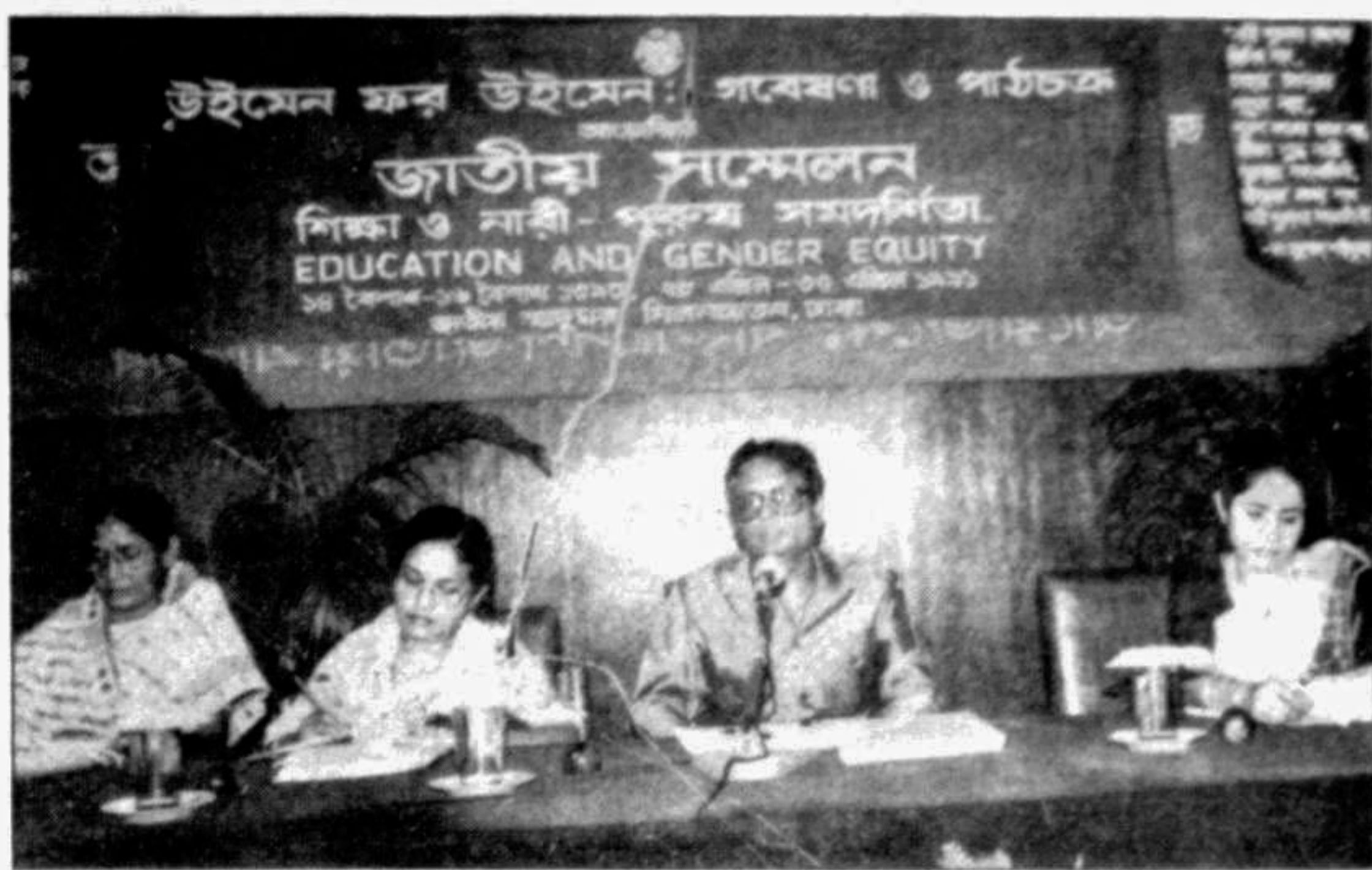
Women for Women: Research and Study Circle, held a seminar on Education and Gender Equity at the National Museum auditorium in the city on Tuesday.

He is also expected to attend a seminar on Bangladesh Foreign Policy at the Oxford University Nuffield College on his way back home, said a press release.