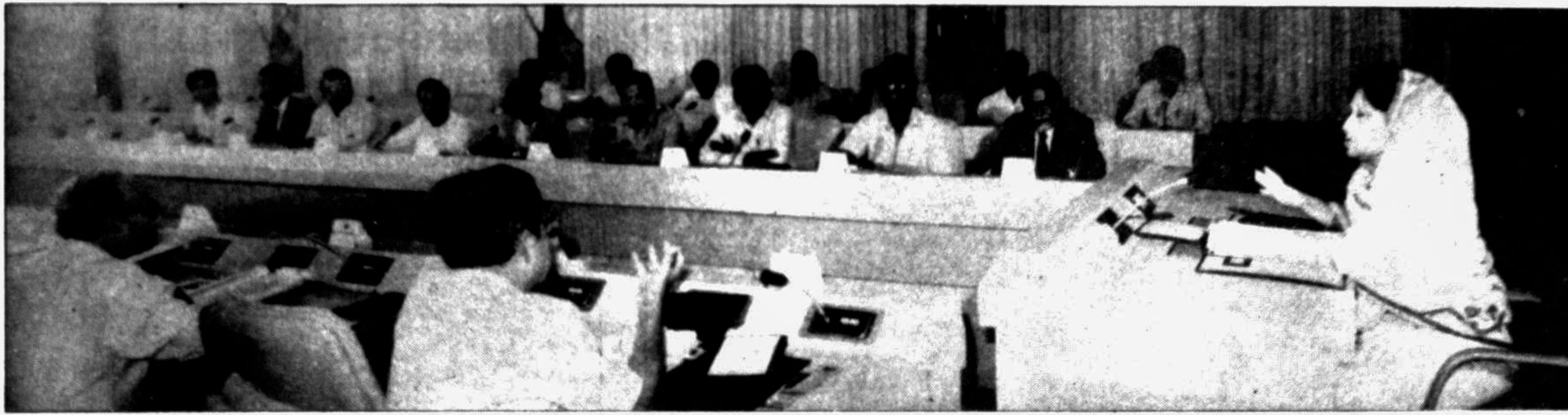
The Council of Ministers met on Monday at Bangabhaban with Prime Minister Begum Khaleda Zia in the Chair.