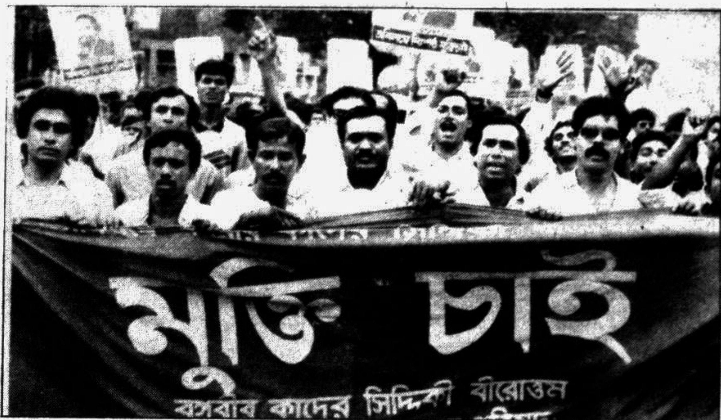
Swadesh Pratibartan Sangram Parishad held a rally in city on Monday demanding release of Kader Siddiqi.

Later a procession was brought out which paraded different city streets.