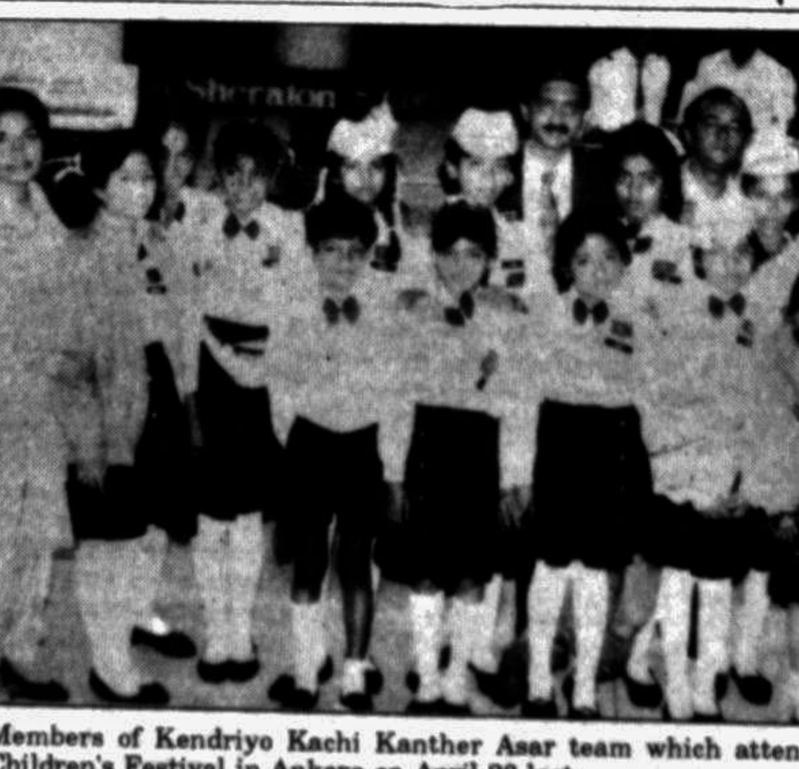
Members of Kandriyo Kachi Kanther Asar team which attended the 13th International Children's Festival in Ankara on April 23 last.

Rain / Thunder shower accompanied by temporary gusty or squally wind is likely to occur at most places over Rajshahi Division till Wednesday morning, Meteorological Department says. The day temperature is likely to fall two to four degree Celsius over the country. The highest temperature recorded in Dinaajpur on Monday was 33.2 degree Celsius while the lowest temperature was 21 degree Celsius recorded in Khepupara. The Maximum temperature in Dhaka city on Monday was 27.2 degree Celsius. The sun sets today (Tuesday) at 6.27 pm and rises tomorrow (Wednesday) at 5.25 am.