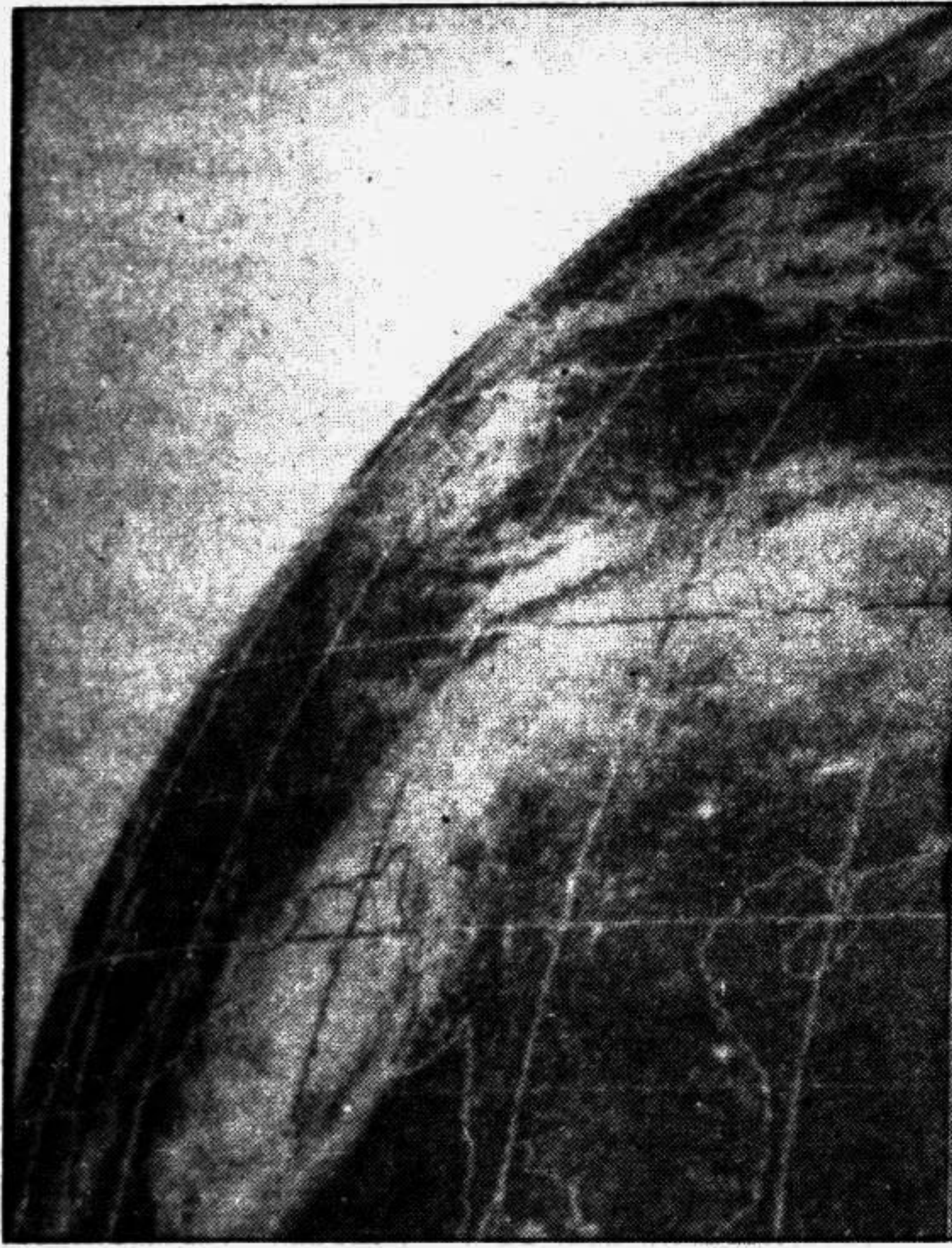
Satellite picture of the severe cyclone taken at 6 pm Monday.

The severe cyclonic storm formed in the Bay of Bengal crossed the Chittagong-Cox's Bazar coasts near the Meghna estuary at midnight last night leaving a trail of destruction, affecting at least seven million people.