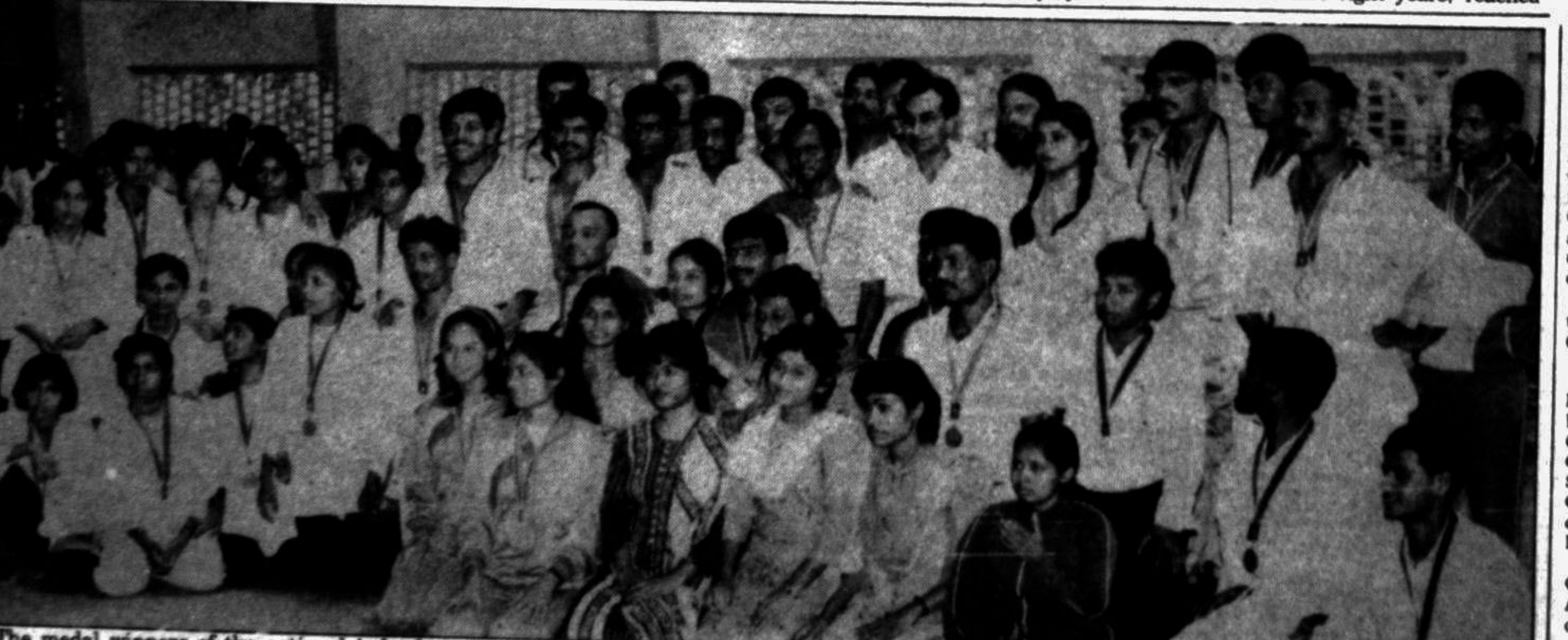
The medal winners of the national judo championships which concluded yesterday at the National Coaching Centre seen with chief guest State Minister for Youth and Sports Mirza Abbas and other officials.