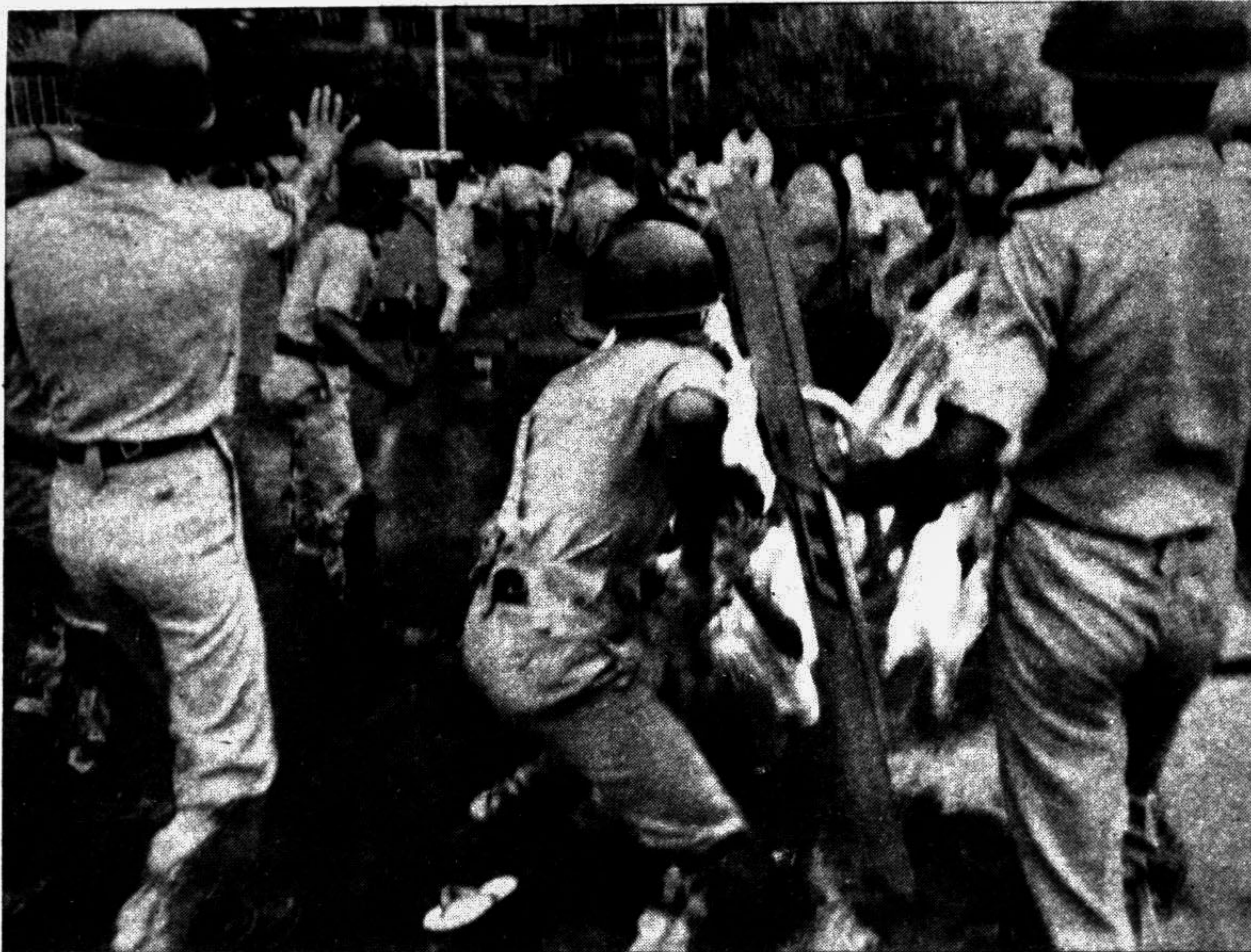
Lathi-wielding police chasing Jatiya Party processionists who went on rampage near Dainik Bangla office in the city on Sunday.