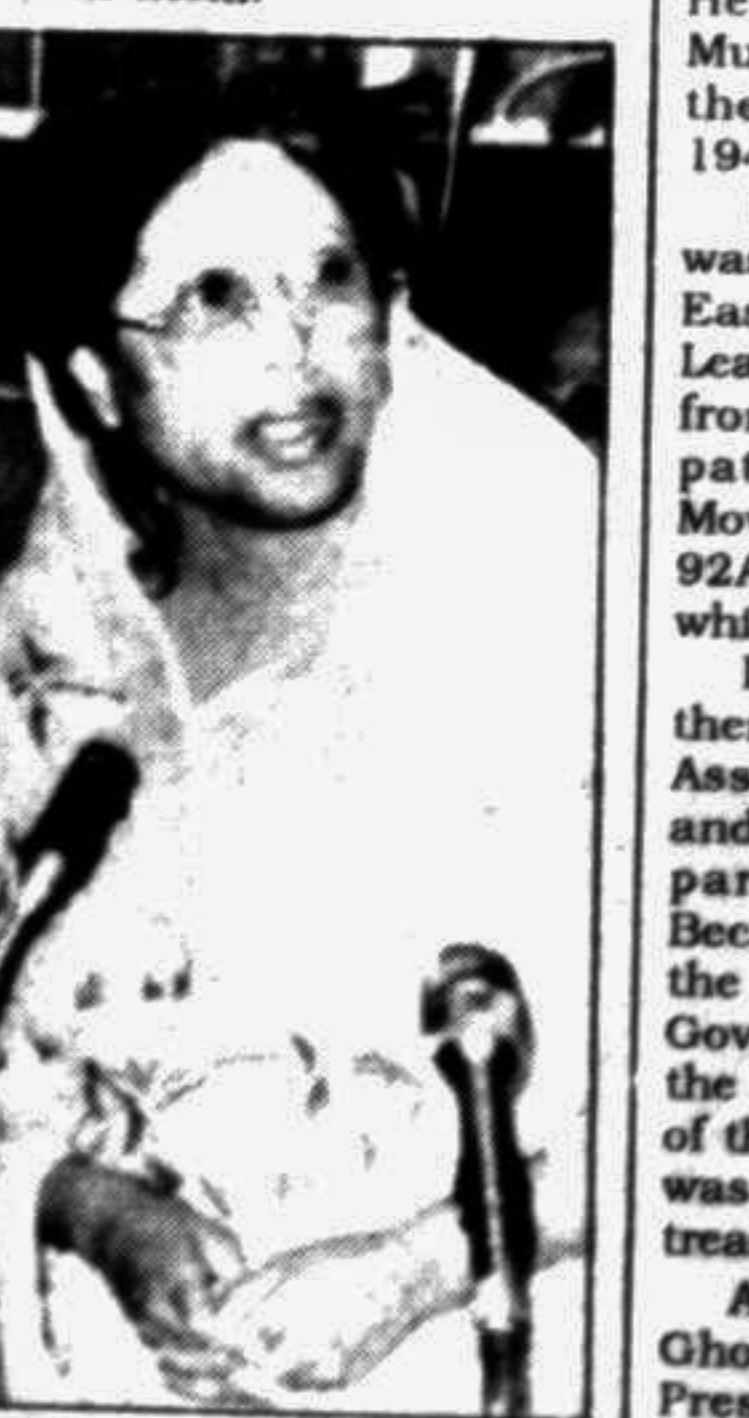
Begum Khaleda Zia

He said the seniors in the house should behave in a way that the new member could learn from them.