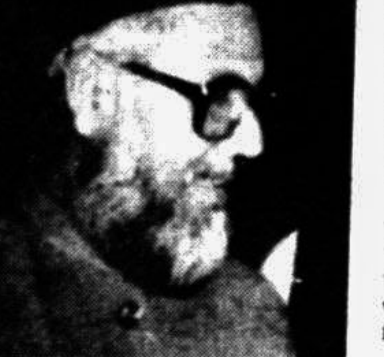
Matiuir Rahman Nizami

The Speaker then took up the order of the day.