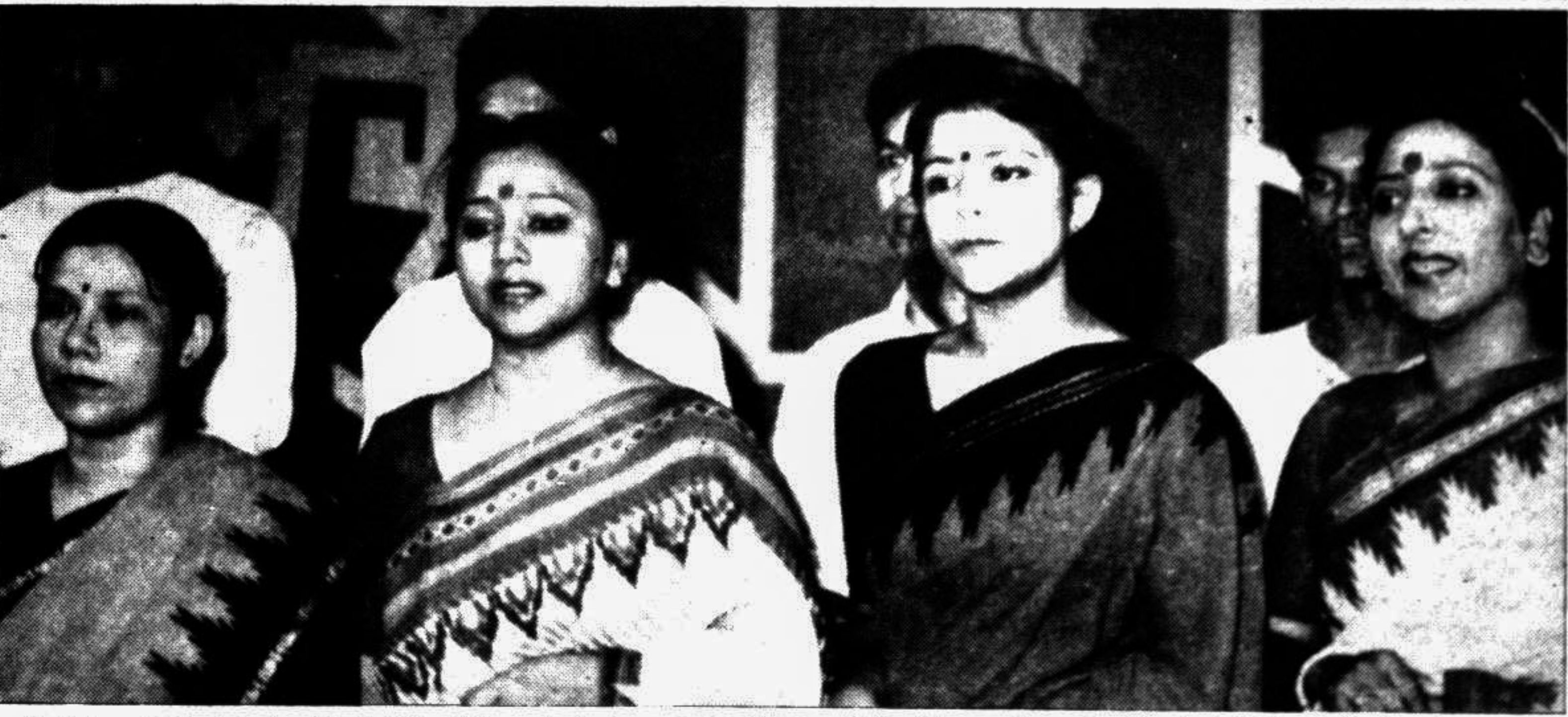
Artistes of Geetabitan Shilpi Gosthi rendering songs in chorus at the Tagore Song Festival at Shilpakala Academy on Saturday.