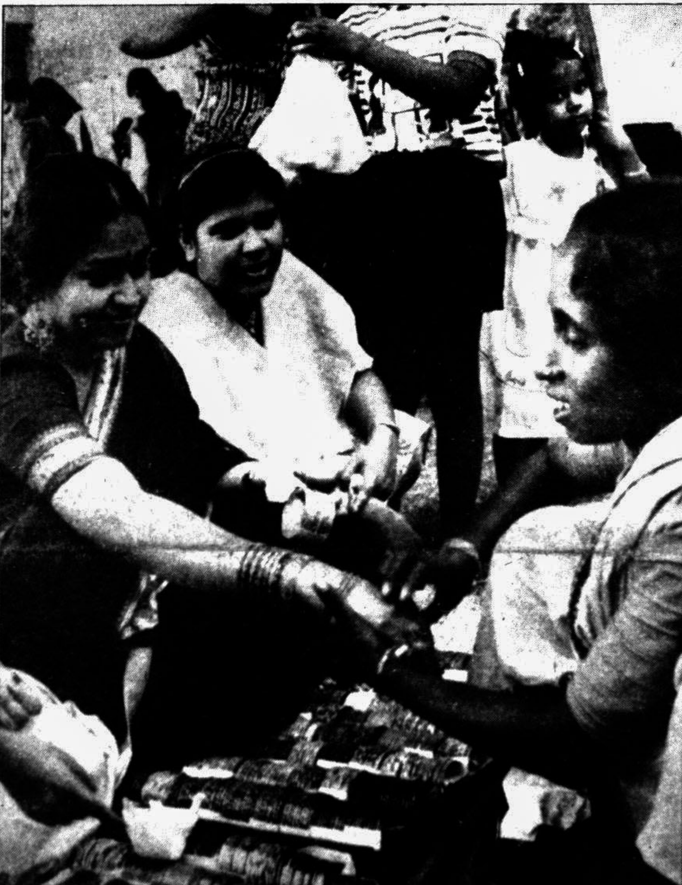
A smiling mother dons multi-coloured glass bangles from a vendor at the Baishakhi Mela in the city while a little girl looks on perhaps with the thought of when her turn will come to have a few pieces of the attractive ornament.

Ershad's lawyer Advocate Strajul Haque submitted in the Tribunal a list of five Defence See Page 10 Col. 6