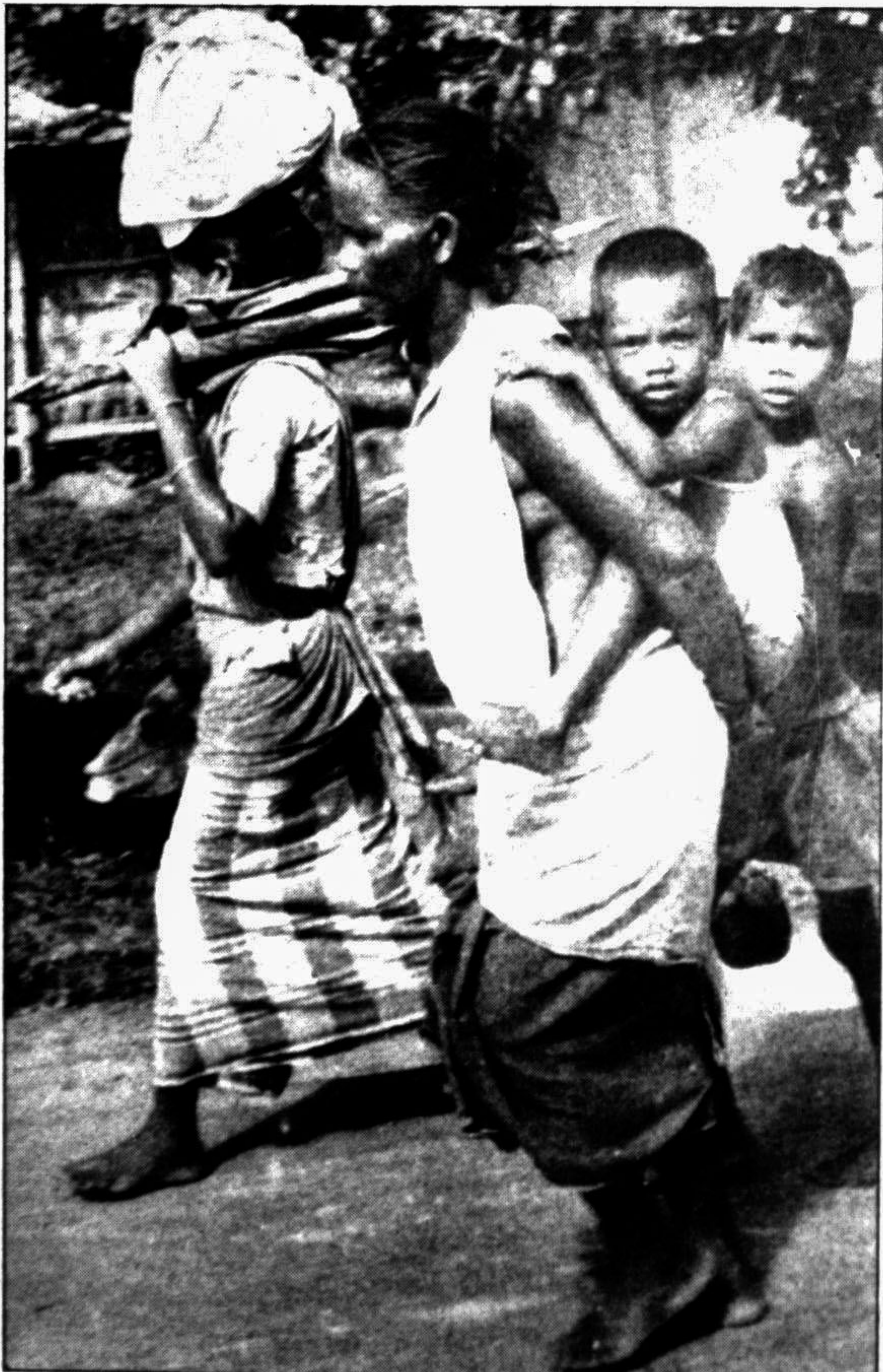
Santal women set out for a day's work at Pirganj in Dinajpur.

The passengers in these routes have appealed many times to the higher authority to mitigate the sufferings of the passengers but to no effect.