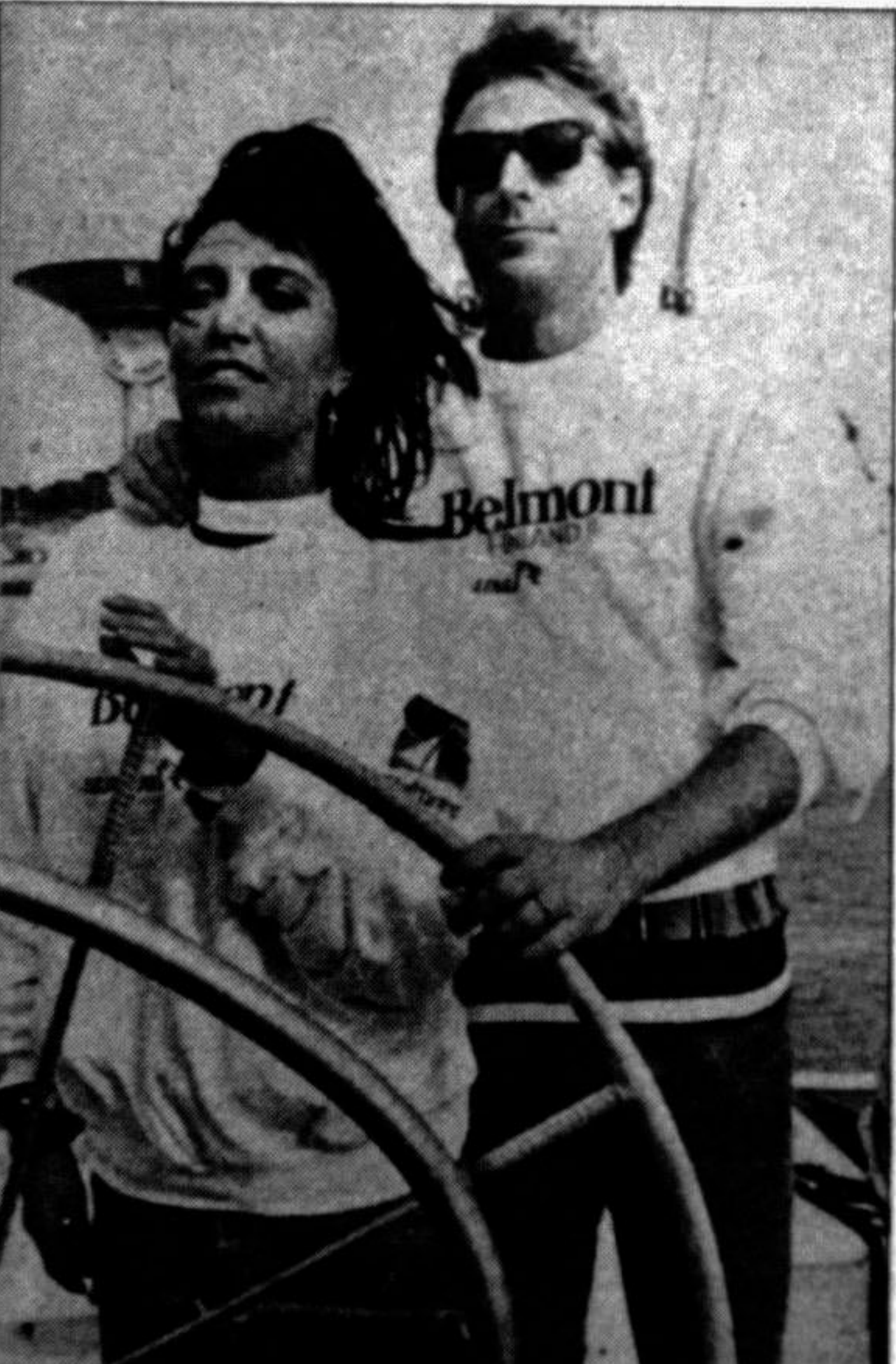
A 1988 file photo of Bjorn Borg and his Italian wife Loredana Berte.

However, a joint Korean team is competing at the World Table Tennis championships here.