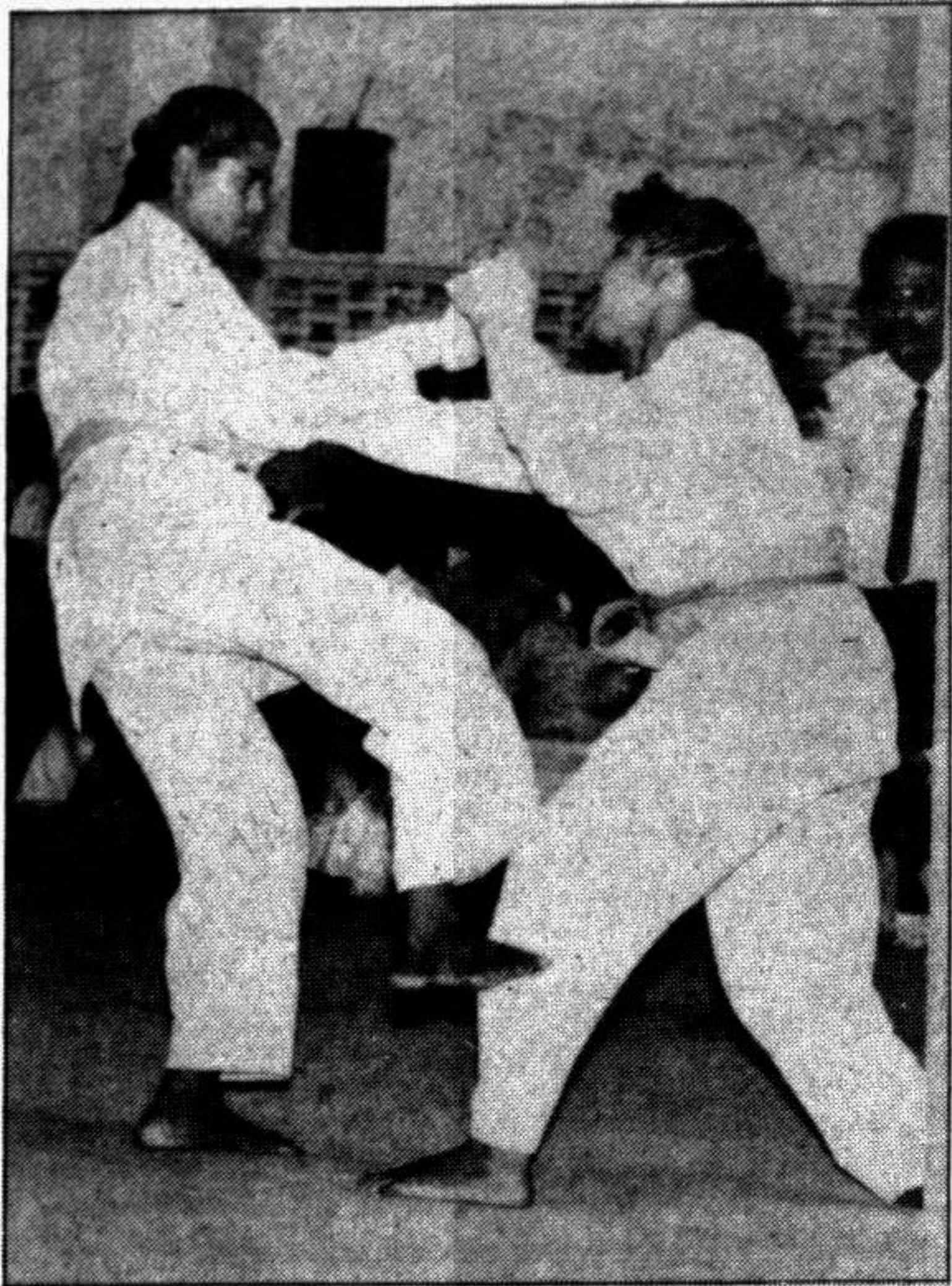
Action from yesterday's concluding day of the 8th national karate championship at the NSC gym