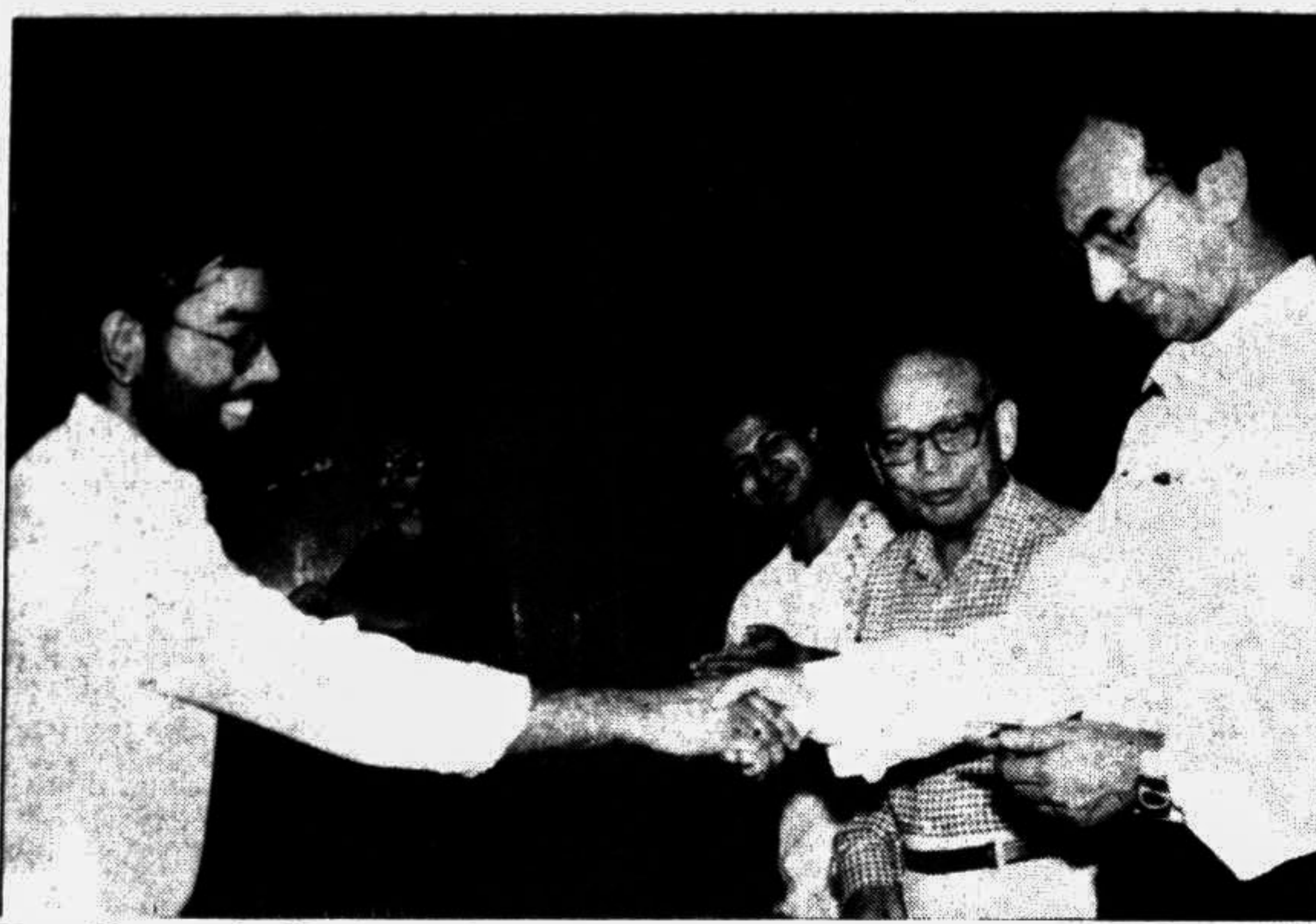
State Minister for Youth and Sports Mirza Abbas conducting the draw for the United Insurance international Masters' chess tournament at the National Coaching Centre yesterday.

CHITTAGONG Apr 24: The traditional 'Jabbar Bolikhela' (Jabbar wrestling) will be held at Lalight Maidan on April 26, reports BSS. Jabbar Bolikhela has been an annual affair here since 1909 which draws thousands of people from all over the country. A Boishakhi Mela will also be held on the occasion.