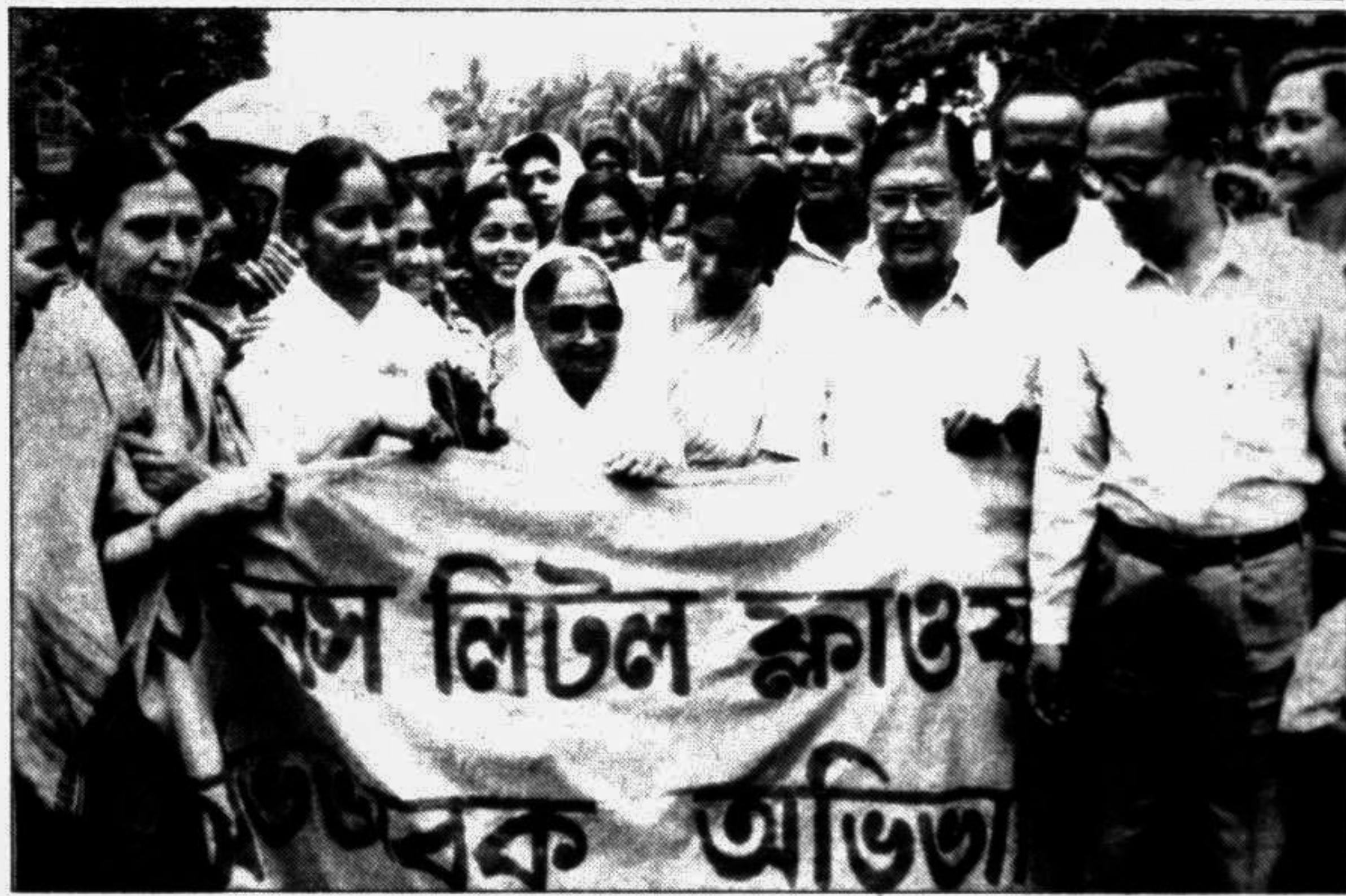
Guardians of students of Wells Little Flower School organised a procession in city on Wednesday protesting an alleged attempt to grab land of the school. Celebrated Poetess Sufia Kamal is seen leading the procession.